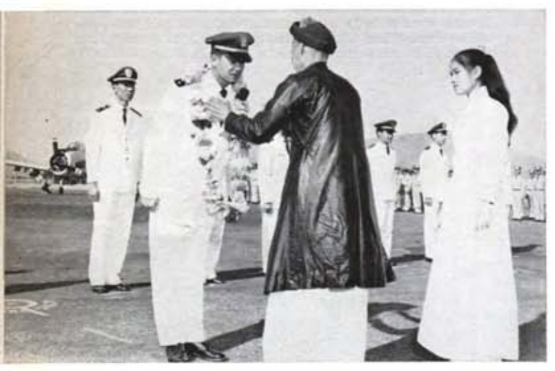
During formal ceremonies on the Nha Trang Air Base ramp marking the Squadron's first anniversary, a pilot hero of Vietnam's "Strategie Hamlet" program receives a floral garland presented by the hamlet patriarch and his daughter.