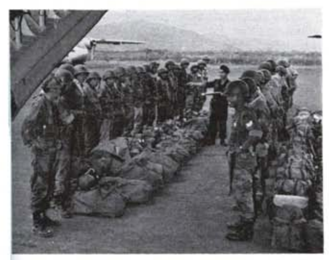
South Vietnamese troops are checked out before boarding C-123 in Operation Phi Hoa II in March, a tactical airround envelopment strike against a force of hard-core Viet Cong regulars fifty miles from capital city of Saigon.