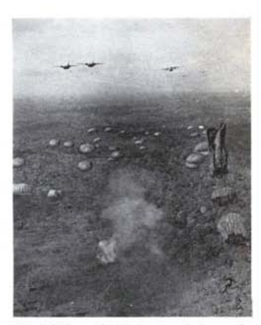
After B-26s and A-1Hs had worked over the Phi Hoa II drop zone with frag bombs, sixteen C-123s dropped 840 Vietnamese paratroops in two minutes. Army H-21 heli-copters followed with 1,500 more troops.