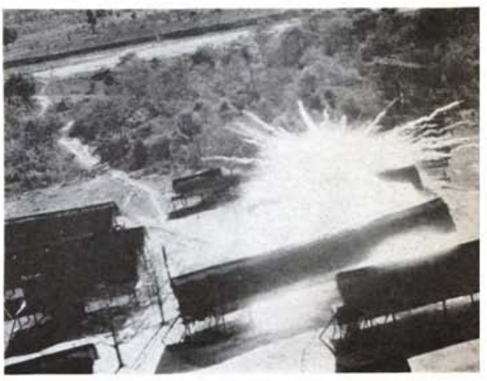
Napalm from a Vietnamese T-28 hits dead center in the longhouse barracks of Communist guerrilla forces. Besides destroying the encampment, Vietnamese pilots raked the surrounding area with bullets and rockets.