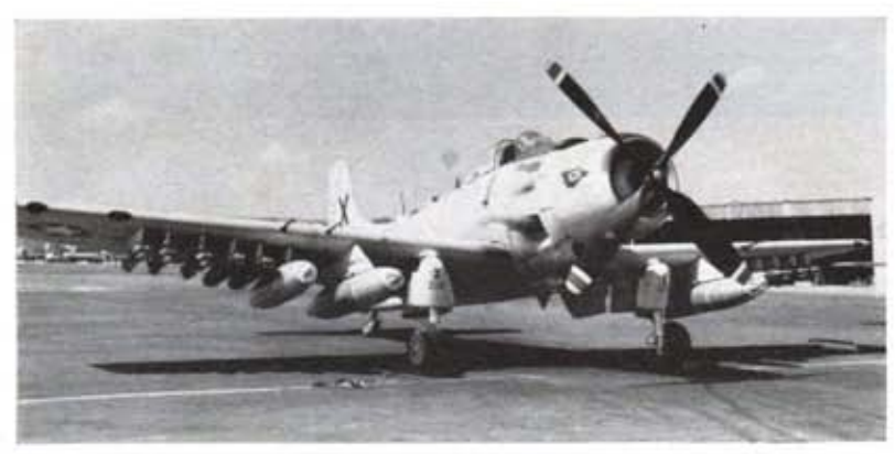
Navy A-1H employed by a second Vietnamese fighter squadron, the 514th FS, carries load of frag bombs and rockets along with .50-ealiber machine guns.

Heavily armed B-26s in Vietnam carry more armamen under wings than B-17s carried internally in WW II, plus fourteen .50-caliber guns. Weapon mix includes 2.75inch rocket pods, fragmentation and general purpose bombs, and flares. They also carry reconnaissance cameras.