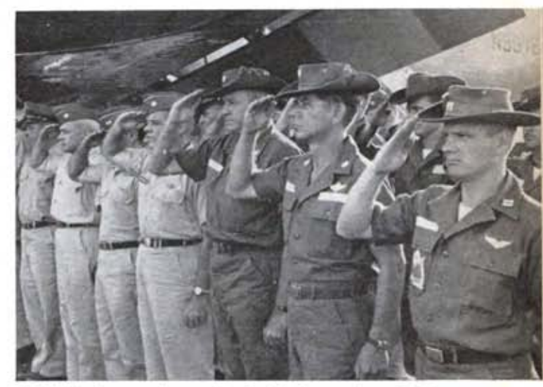
USAF Air Commandos render final salute to three B-26 crewmen in planeside services at Tan Son Nhut Air Base, Saigon, before bodies were flown back to US. Ten airmen—seven Americans, three Vietnamese—have died in B-26 crashes.