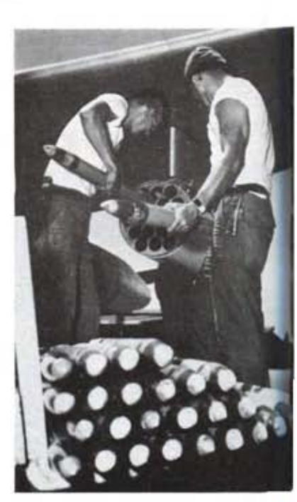
USAF Air Commando crewmen los 2.75-inch rockets in wing pod of B-26 bomber. Commandos, based Hurlburt Field, Fla., rotate to Vietna for periods of four to six months