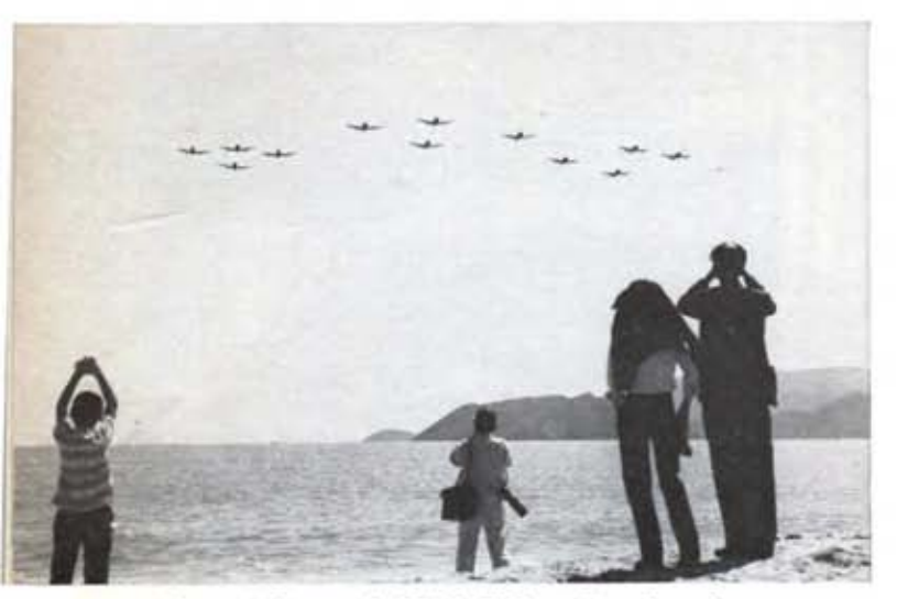
Pilots of Vietnam's 516th Fighter Squadron form up over Nha Trang Bay for finale of first anniversary air show. Most of them took pilot training in the US, followed by intensive combat training under USAF advisers in Vietnam.