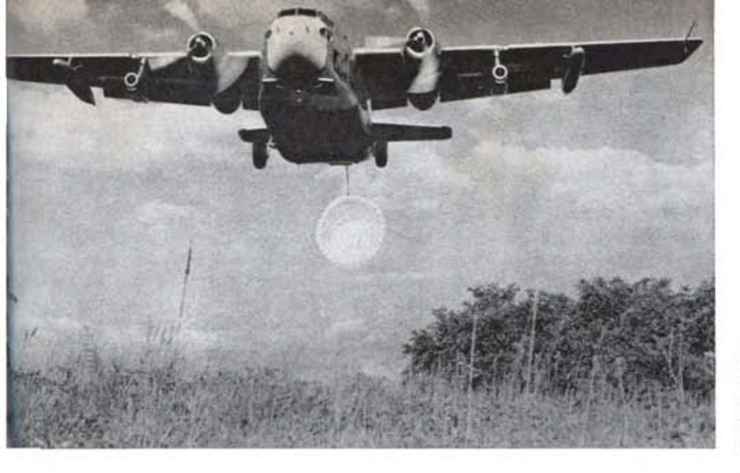
This jet-assisted C-123 assault transport being field-tested in Vietnam uses drag chute to deliver heavy cargo loads in isolated areas without actually landing. Wide track gear permits landing on grass or sand.