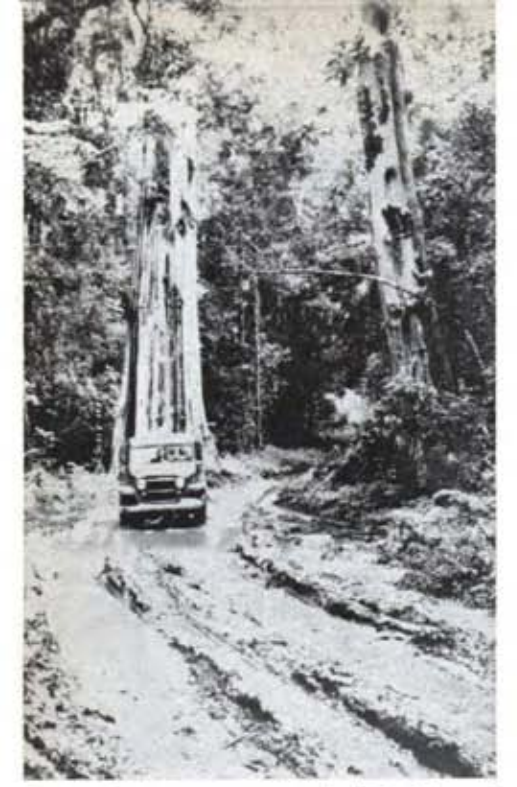
Both the importance and difficulties of air operations in Vietnam are shown here. Muddy trails and dense jungles hamper overland pursuit of guerrillas, but jungle growth obscures enemy moves from the air.

Operating over some of the world's worst terrain, where it's a tough job just to find the enemy, a small, select force of pilots, using a variety of aging equipment, defends the free-world frontier . . .