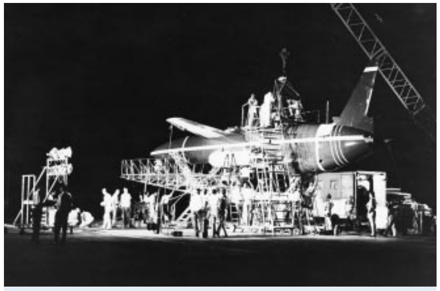
Technicians ready an SM-62 Snark cruise missile at Cape Canaveral Missile Test Annex, Fla. The Snark was to fly to Puerto Rico and return. Instead it vanished after it was last seen off Venezuela.

However, Snark testing, which started in New Mexico and moved to Cape Canaveral Missile Test Annex, Fla., was bedeviled with problems. In its first launch at the Cape, the test Snark crashed after only 15 sec-