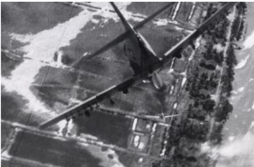
Officially called the Skyraider, the A-1 was used for low-level strikes against concealed targets and for close air support of ground units. It was the airplane of choice to keep the enemy at bay during rescues of downed airmen.

The A-1E Spads had two seats, side by side. There was enough space to fit 10 persons in the aft part of the cabin,