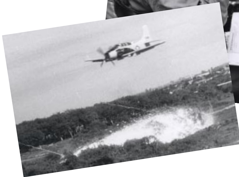
Maj. Bernard Fisher, top, fresh from flying interceptors Stateside, strapped on an A-1E Spad (bottom) in Vietnam. At right, Fisher is shown with his friend, Maj. Dafford "Jump" Myers. A daring, no-hope rescue of Myers led to Fisher's receiving the Medal of Honor.

highlands reached an elevation of 7,000 feet. The ocean was only 30 miles to the east, and the mountain valleys were often hidden by clouds and low-lying fog. The North Vietnamese were counting on such cloud cover to limit air support.