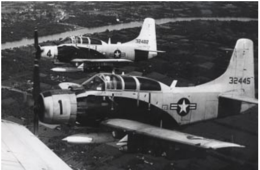
Adapted from the Navy's World War II-era Douglas AD-5, the unglamorous A-1E was ideal for use in Vietnam. The Spad could carry lots of weapons, could stay aloft for hours, and even had room for passengers.

On the gunship's second pass, it was hit hard by ground fire. The right engine was torn from its mounts. Seconds later, the other engine was knocked out, too. The bullet-riddled AC-47 crash-landed on a mountain slope, five miles farther up the valley.