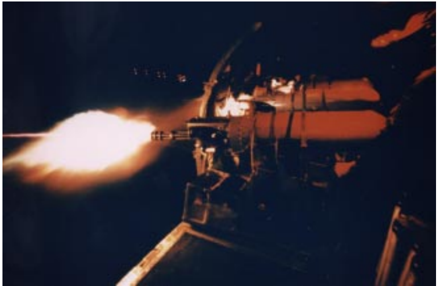
An AC-47 gunship tried to help the beleaguered Green Berets hold out against the North Vietnamese attack on their firebase. Flying at treetop level, the “Spooky” met its end. Rescue of its crew was a story unto itself.