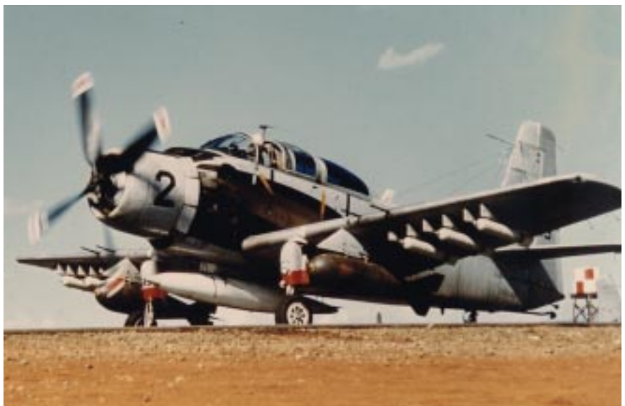
As Fisher's Spad idled, he pulled Myers into the cockpit head first. Myers berated Fisher for a foolhardy rescue attempt that neither of them would likely survive. The rescue A-1 is now at the Air Force Museum in Dayton, Ohio.

Fisher had left the engine running fairly fast, ready for a quick getaway, and the airflow from the big four-bladed propeller was blowing