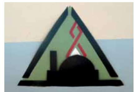
After the successful raid, one of the pilots had this mission symbol painted underneath the cockpit of his F-16.

The attack caught the air defense gunners flat-footed. They were in the cafeteria for supper, the radars shut down and cold. The defenders got a few shots off at the last of the F-16s,