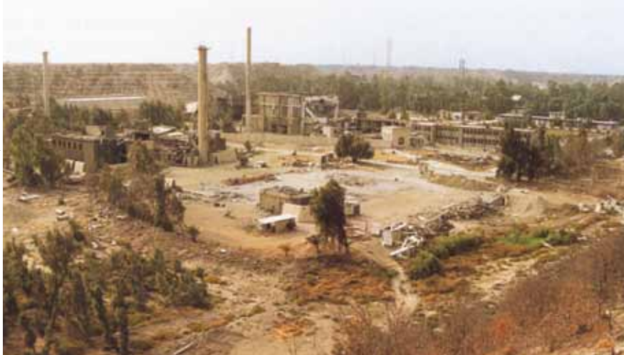
The former site of the Osirak nuclear reactor building was photographed during Desert Storm. The reactor was located next to the narrow smokestack in the far center of the photograph.

but they were shooting wildly and manually, without radar or computers. Attempting to pick off the diving F-16s, the gunners raked their own forces across the way.