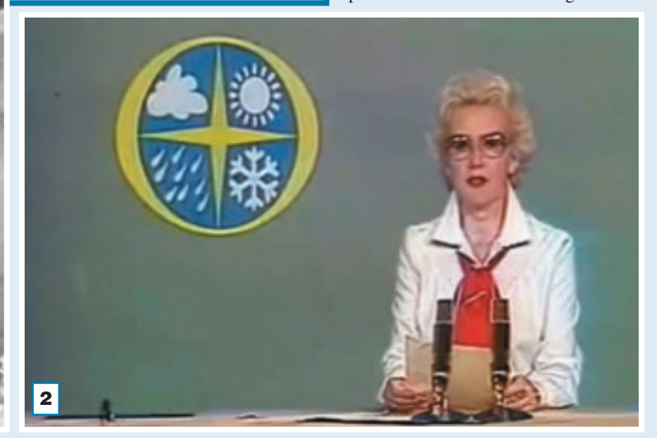
AIR FORCE Magazine / October 2013

It reported that, while the civilian weather services of all nations maintain special channels solely for the transmission of meteorological data, military services—particularly major commands—"have special channels set apart for the dissemination of weather data." In addition, they "may, and very often do, employ other nets (operational, administrative, etc.) for the same purpose." While the stations designated for