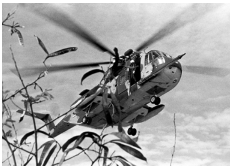
An HH-3E in action during the Vietnam War.

Designed, built by Sikorsky \star first flight (USAF model) June 17, 1963 \star crew of 2 or 3 \star capacity 25 troops or 5,000 lb cargo \star two GE T58-GE-5 engines \star number built 135 (USAF) \star Specific to HH-3E: max speed 164 mph \star cruise speed 154 mph \star max range 760 mi \star armament two GE 7.62 mm M60D machine guns \star weight (max) 22,000 lb \star span (rotor diameter) 62 ft \star length 73 ft \star height 18 ft 1 in.