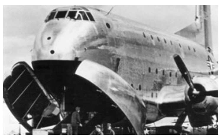
The clamshell doors made loading a snap.