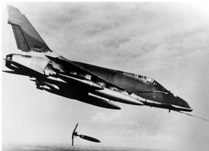
Super Sabre on the attack.