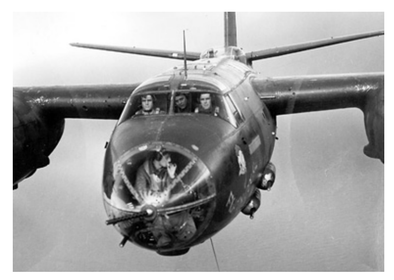
The Marauder was a bomber of radical new design.