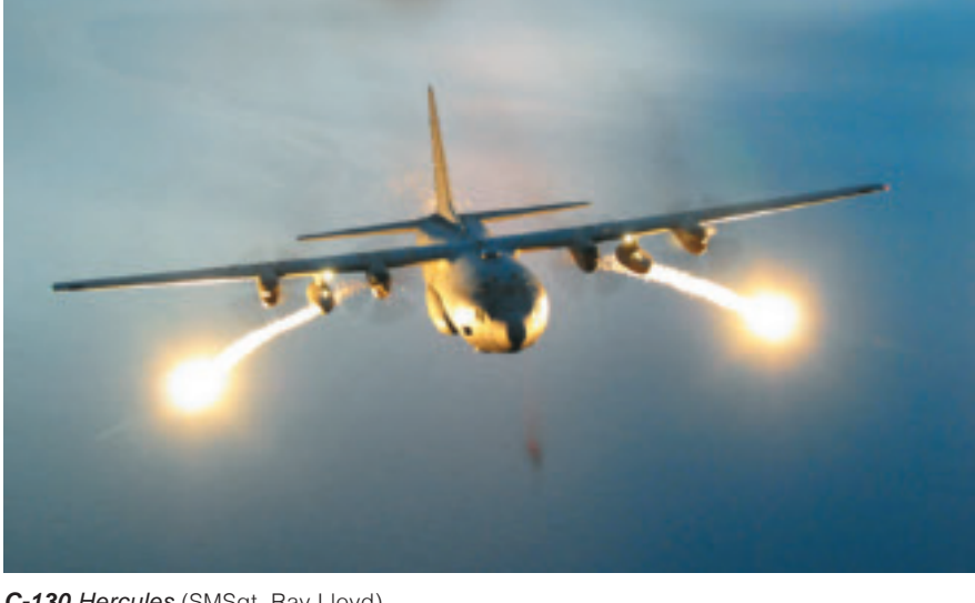
C-130 Hercules

Weight: max T-O 155,000 lb (E/H/J), 164,000 lb (J-30); max payload 42,000 lb (E/H/J), 44,000 lb (J-30).