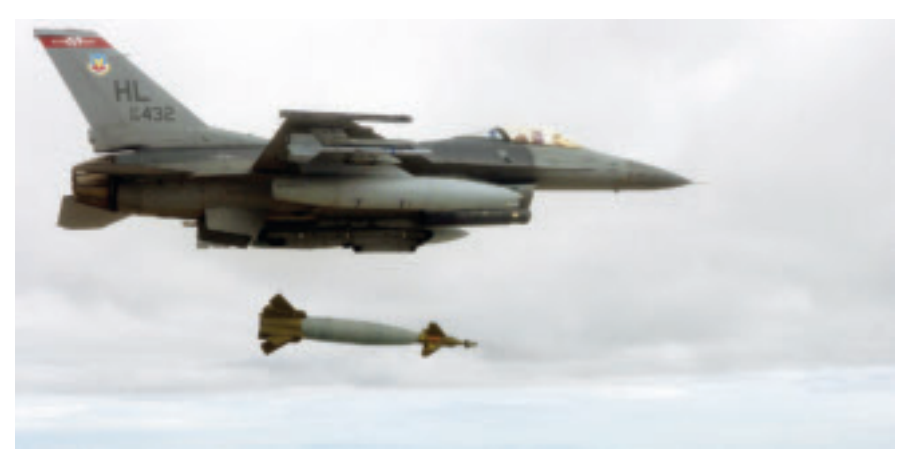
GBU-10 Paveway II

Tactical munitions dispenser with a payload of 10 BLU-108 submunitions, each containing four skeet projectiles, for a total of 40 lethal projectiles that seek out their target. The skeet's active laser and passive IR sensors can detect a vehicle's shape and