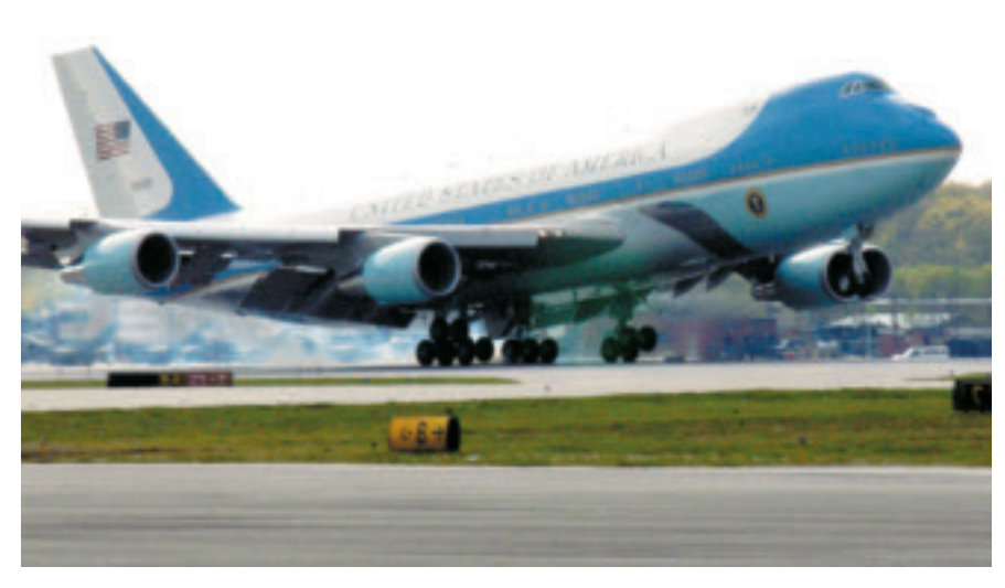
VC-25 Air Force One (SrA. Elizabeth Slater)

First Flight: first flown as Air Force One Sept. 6.1990.