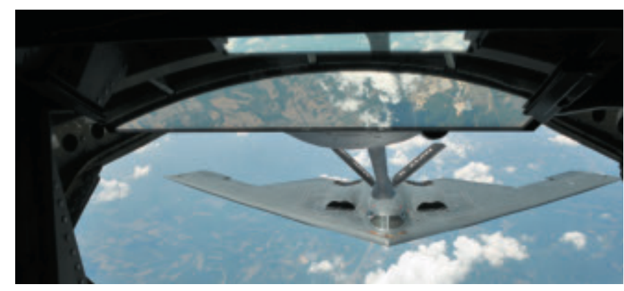
B-2A Spirit (A1C Maurice A. Hodges)

Dimensions: span 172 ft, length 69 ft, height 17 ft.