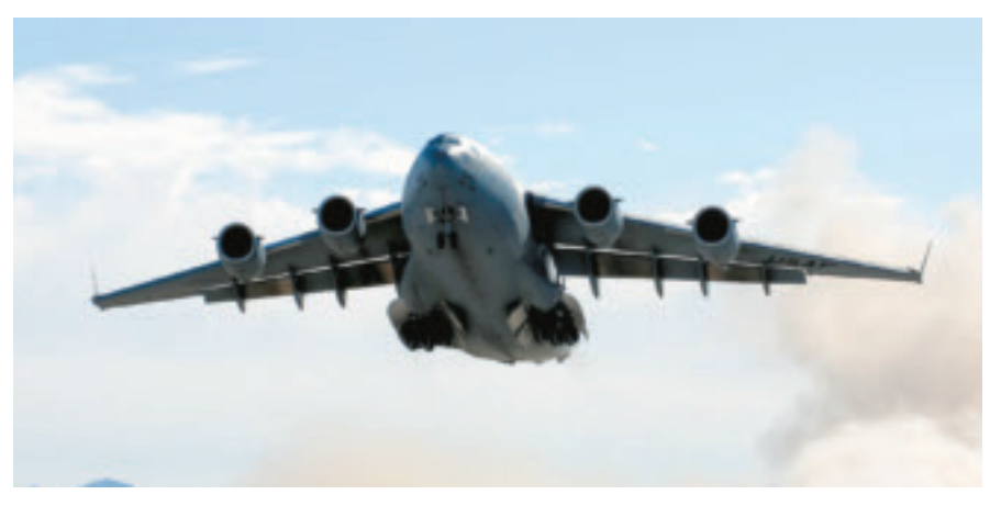
C-17 Globemaster III

Some models equipped with defensive system.