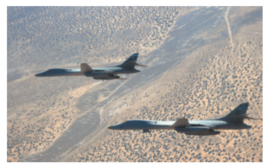
B-1B Lancers

■ B-1B. Vastly upgraded B-1A, with 74,000 lb increase in useable payload, improved radar, and reduction in radar cross section, but max speed cut to Mach 1.2. Total production of 100 B variants, but USAF reduced inventory to 67 aircraft in 2002. One lost in 2008. First used in combat against Iraq during Desert Fox in December 1998. Equipped over the years with GPS, smart weapons carriage, improved onboard computers, improved communi-