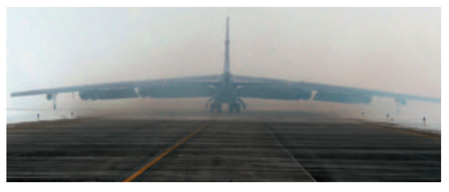
B-52H Stratofortress