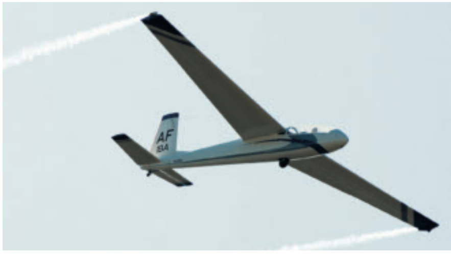
TG-10C Kestrel (Mike Kaplan)

■ T-51A. The aircraft is equipped with modern