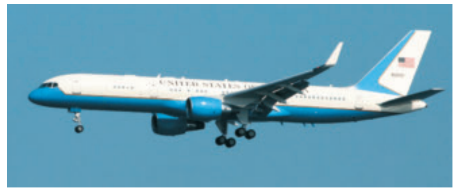
C-32A Air Force Two (Sam Meyer)

Power Plant: two Pratt & Whitney PW2040 turbo-