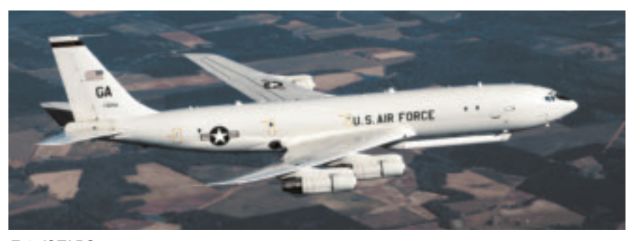
E-8 JSTARS

■ E-8C. Production version delivered from 1996 to 2005. Earlier aircraft retrofitted to final production Block 20, featuring more powerful computers, an Internet protocol local area network, and BLOS connectivity. USAF plans to retire one aircraft damaged beyond economical repair, but others expected to remain in service until 2034. Develop-