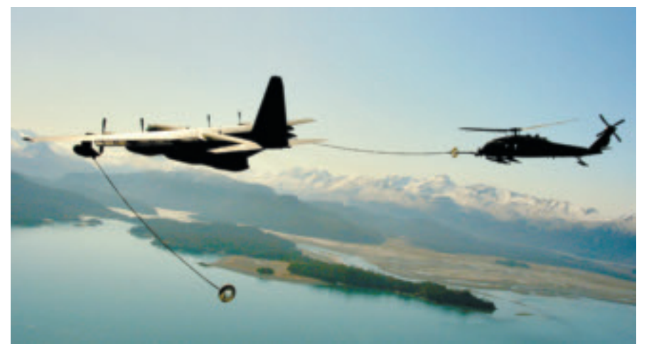
HC-130 King (I) and an HH-60 Pave Hawk (r)

WRS for weather reconnaissance duties. Includes two external 1,400-gallon fuel tanks and internal 1,800-gallon tank. Features include improved radar and Dowty 391 six-bladed composite propellers. Equipment includes the GPS Dropsonde Wind-finding System, equipped with HF radio and sensing devices and released about every 400 miles over water, measuring and relaying to the aircraft a vertical atmospheric profile.