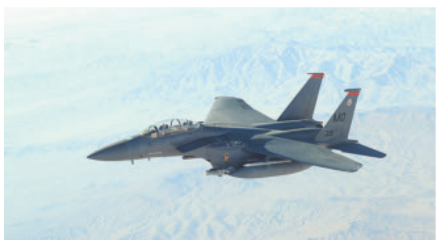
F-15E Strike Eagle

■ F-15E. Has advanced cockpit controls, displays, and a wide-field-of-view HUD. Array of integrated avionics and electronics to permit fight at low, medium, or high altitude, day or night, and in all weather conditions. Carries LANTIRN targeting pods and Sniper and Litening ATPs on dedicated sensor stations. SAR pod provides surveillance and reconnaissance support to ground operations. Potent ground attack capability supplied by GPS-aided and precision weapons and by 20 mm gun for strafing. Air-to-air capability based on array of radar guided