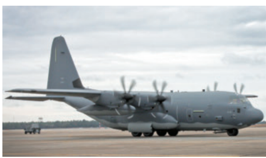
MC-130J Commando II

Contractor: Lockheed Martin (airframe), Boeing.