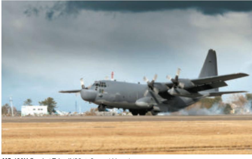
MC-130H Combat Talon II

IOC: 1966 MC-130E; June 1991 MC-130H. Production: 22 new-build MC-130Hs. Inventory: 5 MC-130E; 20 MC-130H.