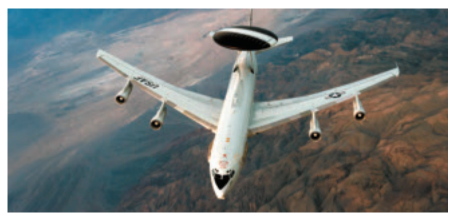
E-3 Sentry

Power Plant: single P&W PT6A-67B, 1,200 shp. Accommodation: officer: two pilots, one CSO.