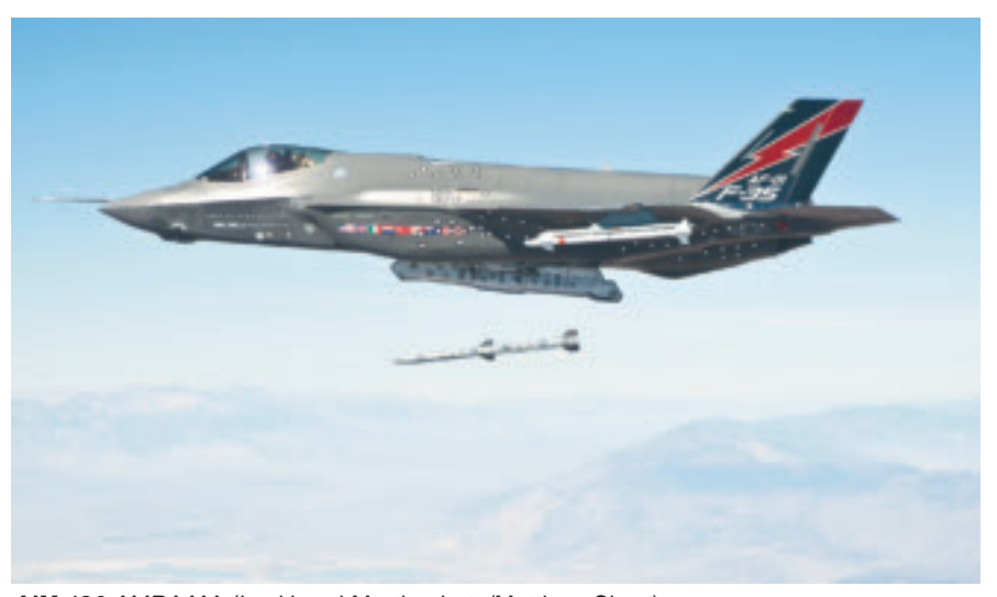
AIM-120 AMRAAM

silo. Sole remaining US land-based ICBM. Major life extension program ensures viability to 2020. Ongoing mods would extend that to 2030.