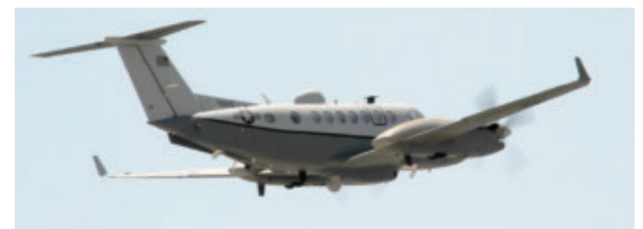
MC-12W Project Liberty

Dimensions: span 58 ft, length 46.7 ft, height 14.3 ft. Weight: max T-O 15,000 lb (350) and 16,500 lb (350ER).