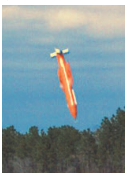
GBU-43B MOAB Bomb

USAF partnered with the Defense Threat Reduction Agency in 2004 on early development and test.