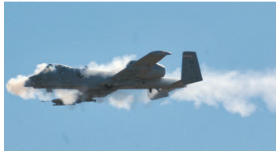
A-10C Thunderbolt II

Aircraft Location: Barnes Arpt., Mass.; Eglin AFB, Fla.; Great Falls Arpt., Mont.; Jacksonville Arpt., Fla.;