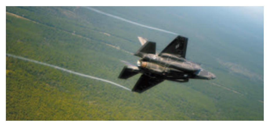
F-35A Lightning II

The F-35 is a joint and multinational program aimed at developing and fielding an affordable, highly commonfamily of next generation strike fighters. For US forces, the program provides: F-35A conventional takeoff and landing (CTOL) variant for the Air Force; F-35B short takeoff and vertical landing (STOVL) variant for USMC; and F-35C carrier variant (CV) variantfor USN. USAF's F-35A will replace F-16 and A-10 fleets with a stealthy multirole fighter. Designed to be able to enter heavily defended enemy airspace and engage all enemy targets in any conflict. Features advanced stealth design, high maneuverability, long range, and advanced avionics.