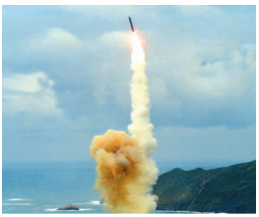
LGM-30G Minuteman III (USAF)

IOC: 1977. Production: three. Inventory: three.