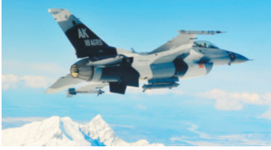
F-16 Fighting Falcon

Workhorse of the USAF fighter fleet. A lightweight fighter supporting the majority of PGM taskings in combat operations. Among the most maneuverable fighters ever built. First flown by USAF in combat in 1991 Gulf War; USAF F-16s flew 13,500 missions, more than any other type. All Block 40/42 and 50/52 F-16s upgraded with the Common Configuration Implementation Program (CCIP), providing standardized cockpit configuration with color MFDs and software, modular mission computer, helmet mounted cueing system, and Link 16 data link