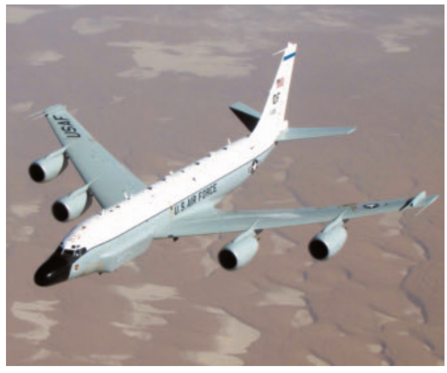
RC-135V/W Rivet Joint (USAF photo)

■ RC-135S Cobra Ball. Provides the capability