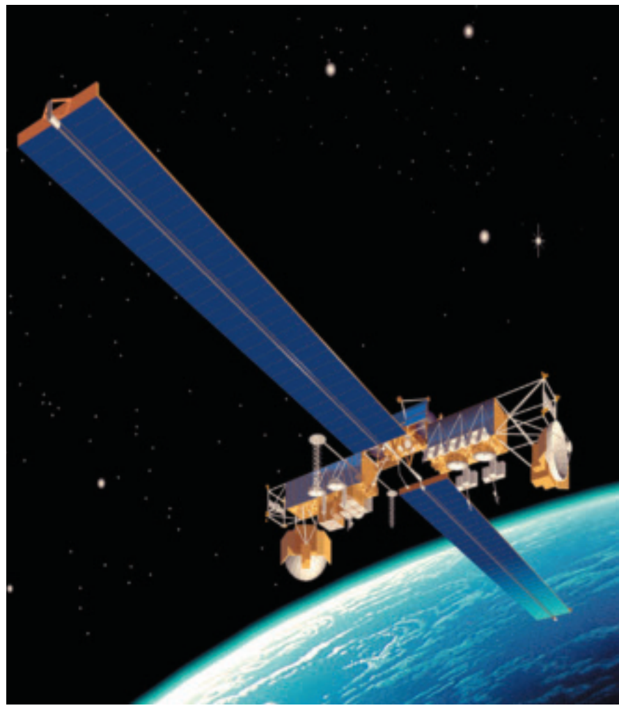
Milstar (Lockheed Martin illustration)