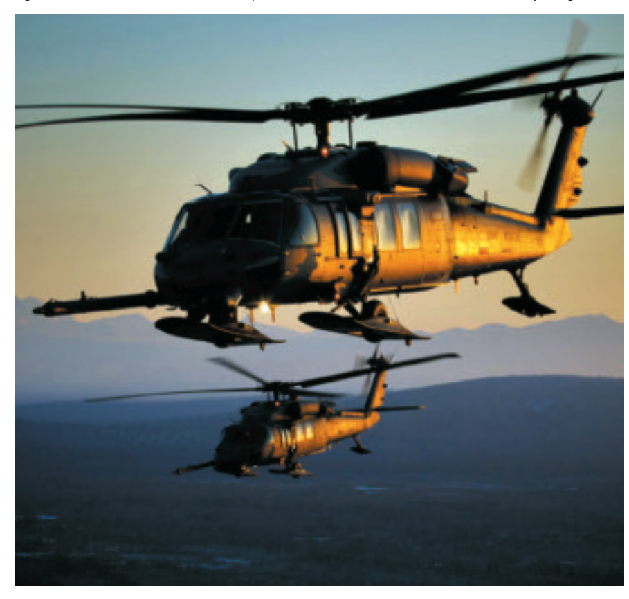
HH-60 Pave Hawk