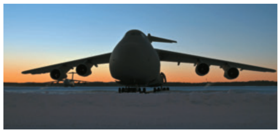
C-5 Galaxy

■ C-5B. Embodies all improvements since completion of C-5A production, including strengthened wings, improved turbofans, and improved avionics, with color weather radar and triple INS. First flight September 1985. First delivery in January 1986.