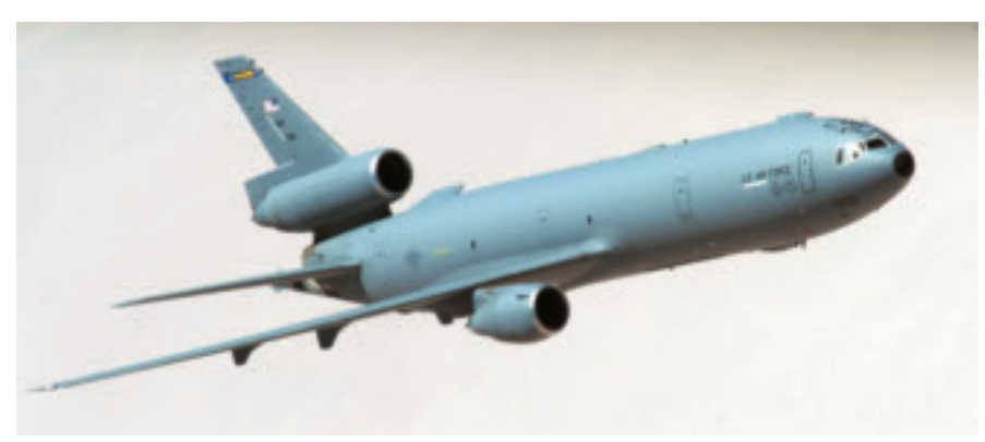
KC-10 Extender