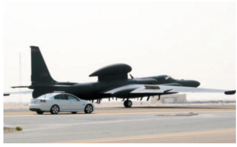
U-2 Dragon Lady