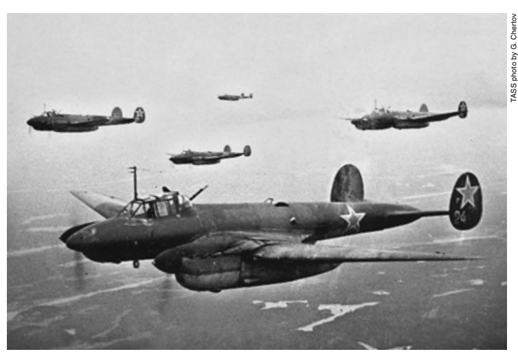
Pe-2 bombers on a mission over the Karelian Isthmus in the summer of 1944.

Flown by unusually large number of women pilots \star took the life of Petlyakov in 1942 crash \star built in 17 variants \star used against Soviets by Finns flying captured models (supplied by Germany) \star nicknamed "Peshka"—"Pawn"—by Soviet pilots \star made conspicuous contributions in battles for Moscow, Stalingrad, Kursk, and Berlin \star assigned initially to front-line ground units \star stalled at high angles of attack \star equipped with ShKAS machine gun that could easily jam.