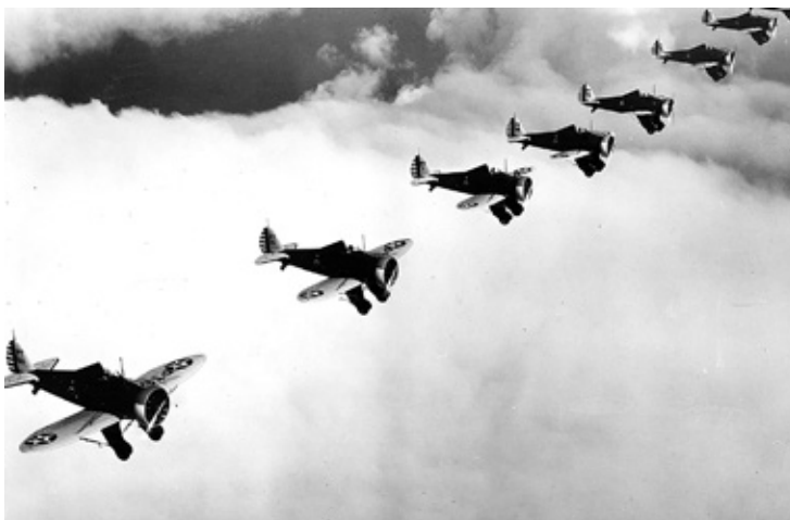
A combat formation of Boeing P-26A airplanes in May 1938.

Made first flight only three months and 15 days after contract signing ★ used external stainless steel bracing and fixed landing gear to reduce complexity and weight ★ built under largest Army aircraft contract since Boeing's MB-3A of 1921 ★ produced for $9,999 each ★ given designation of Model 281 for export ★ purchased by China in 1930s with funds raised by Chinese Americans, who placed contribution boxes in Chinese restaurants ★ used by Chinese air force in 1937 to shoot down several Japanese bombers ★ remained in service (Guatemalan air force) until 1957.