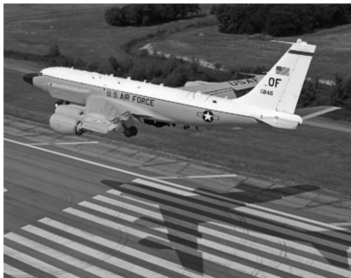
An RC-135 Rivet Joint on final approach.

Derived from prototype Boeing 367-80, progenitor of the famous 707 ★ deployed first by SAC ★ broadcasts variety of direct voice communications, including imminent threat warnings ★ military system: on-board sensor suite to identify and geolocate signals throughout EM spectrum ★ offers data and voice links to friendly ground forces ★ conducts Elint and Comint intercept operations out to 150 miles ★ operated by RAF (Rivet Joint) ★ nicknamed (individual Rivet Joint aircraft) Greyhound, Junk Yard Dog, Anticipation, The Flying W, Rapture, Jungle Assassin, Sniper, Red Eye, Fair Warning, Don't Bet on It, Problem Child, Luna Landa.