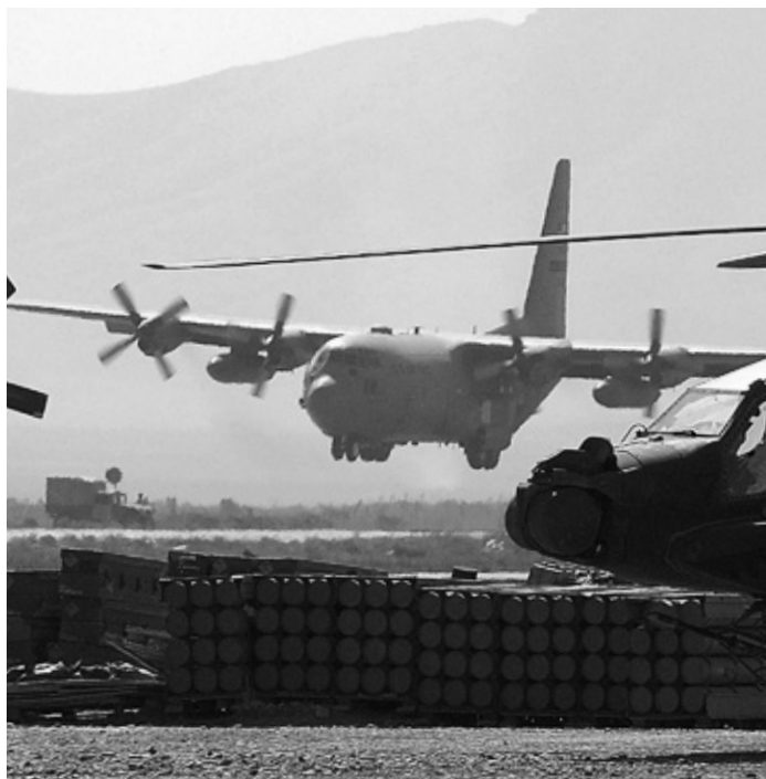
A C-130 lands at a remote landing strip in Afghanistan.