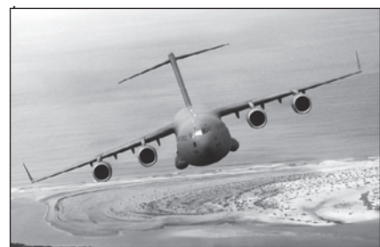
A C-17 from Charleston AFB, S.C., banks to the right.

This aircraft: USAF C-17A Globemaster III—#05-5153, Spirit of Kamehameha-Imua —as it looked in 2015 when assigned to the 535th Airlift Squadron, 15th Airlift Wing, JB Pearl Harbor-Hickam, Hawaii.