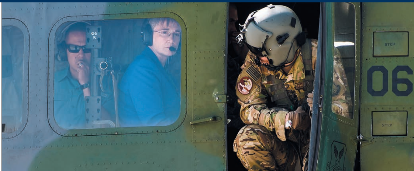
Secretary of the Air Force Heather Wilson, center, tours the 5th Bomb Wing and 91st Missile Wing at Minot AFB, N.D.