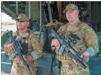
386th Expeditionary Security Force Fly-Away Security Team (FAST) members wait outside of a C-17 Globemaster III prior to takeoff.