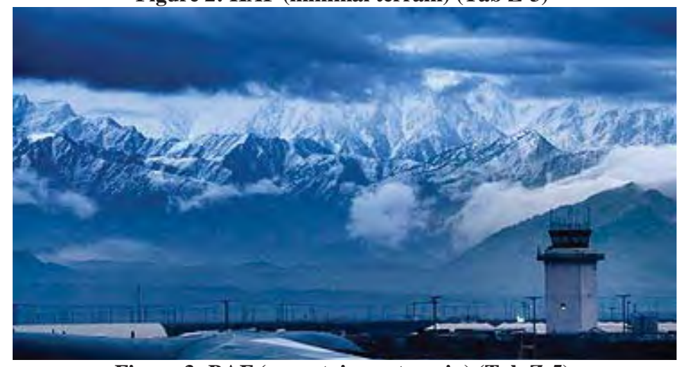
Figure 3: BAF (mountainous terrain) (Tab Z-5)