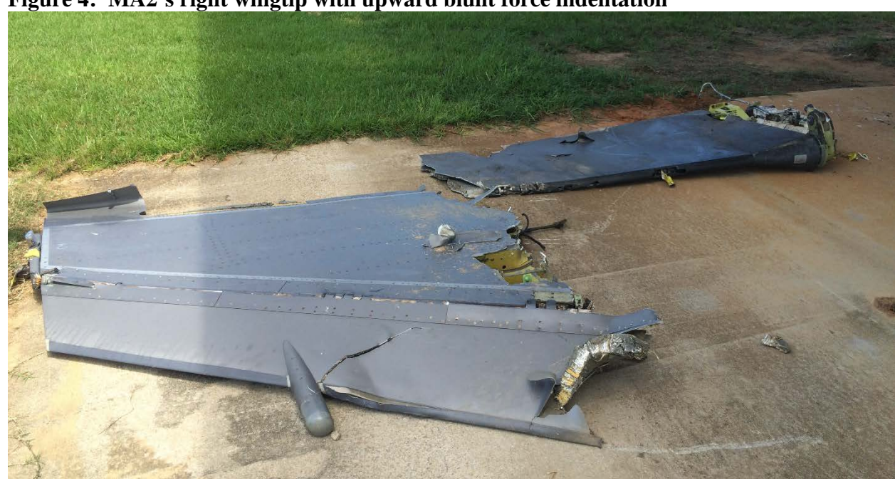
Figure 4: MA2's right wingtip with upward blunt force indentation