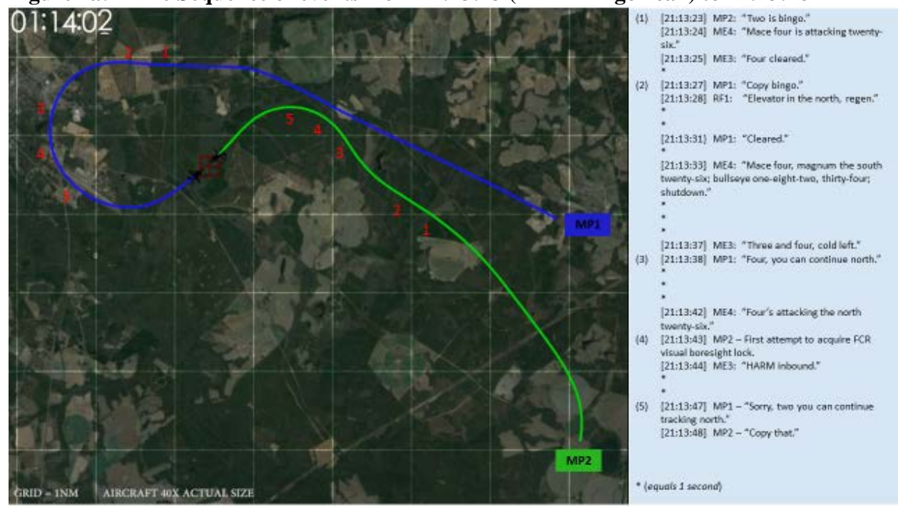
Figure 1a: Time Sequence of events from 21:13:23 (MP2 "Bingo" call) to 21:13:48

MA1 and MA2 flight controls first revealed significant control inputs approximately one second prior to the mishap (Tab J-17 and J-22).