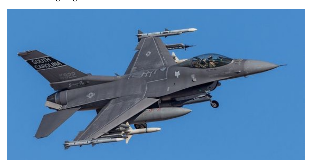
The F-16C Fighting Falcon is a compact, multi-role fighter aircraft (Tab CC-16 to CC-19). It is highly maneuverable and is proven in air-to-air combat and air-to-surface attack (Tab CC-16 to CC-19). It provides a relatively low-cost, high performance weapon system for the United States (US) and allied nations (Tab CC-16 to CC-19).