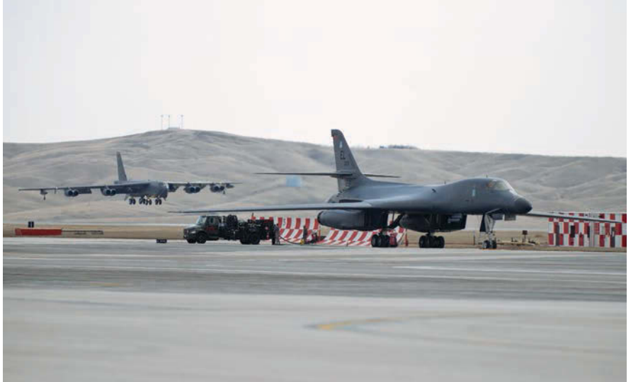
A B-52H lands near a B-1B at Ellsworth AFB, S.D., during a runway reconstruction project in 2014.