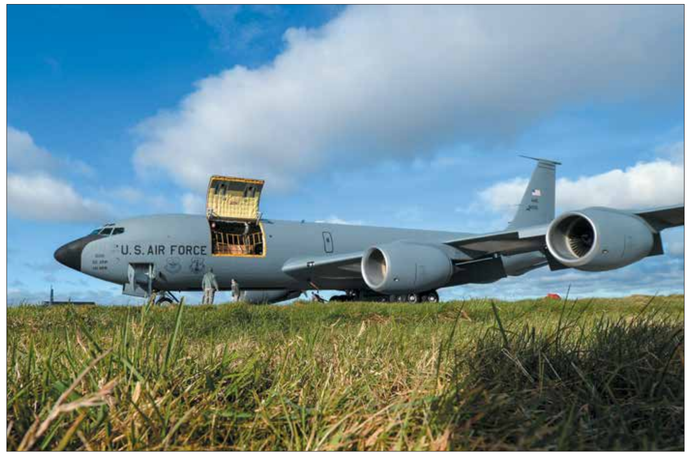
Airmen from the 100th Air Refueling Wing inspect a KC-135 at RAF Mildenhall, UK.