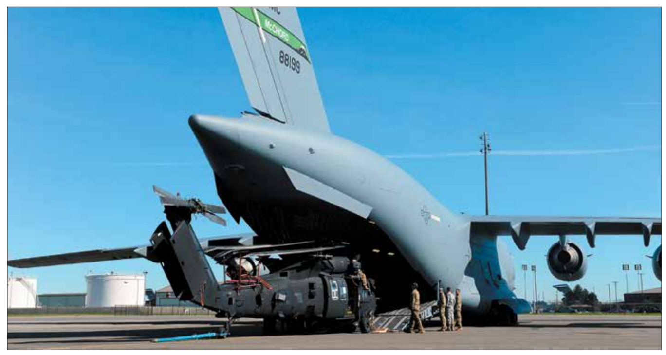
An Army Black Hawk is loaded onto an Air Force C-17 at JB Lewis-McChord, Wash.