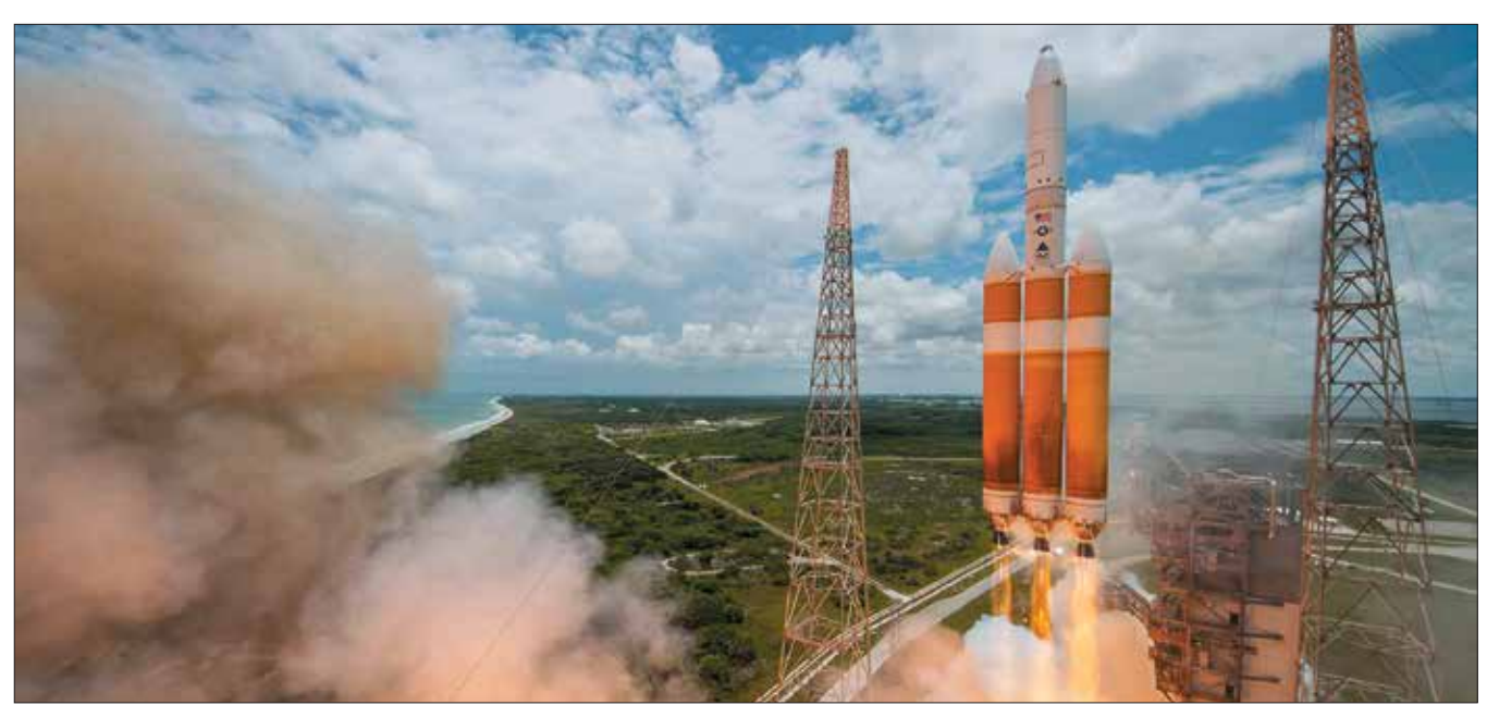
The 45th Space Wing supported this SpaceX launch on June 15, 2016, at Cape Canaveral AFS, Fla.