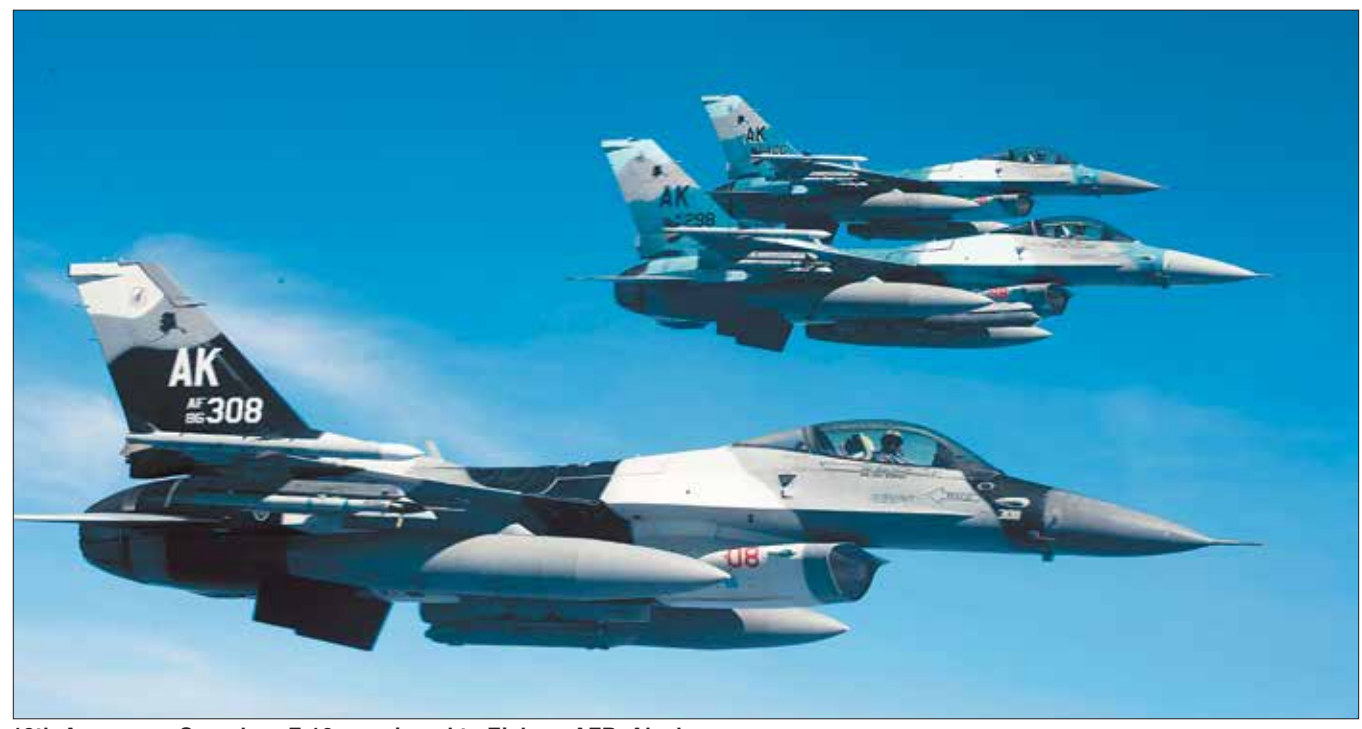
18th Aggressor Squadron F-16s, assigned to Eielson AFB, Alaska.