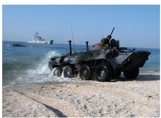
Ukrainian marine 1st and 2nd divisions stormed the beaches of Tenrda island from amphibious assault ships and helicopters to simulate landing on an island over run by pirates during a combined and joint maritime exercise in the Black Sea

Turkey. Turkey remains a strong ally and partner in the region and continues to grow in importance in the Middle East and Eurasia regions. Turkey will continue to play an important role in the fight against extremism, maintaining regional security and access, deterring common threats, and supporting NATO out-of-area operations, such as those in Afghanistan and Kosovo. As our presence in Iraq draws down, Turkey's concern with possible volatility on their border