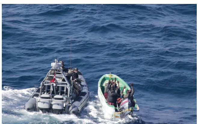
Danish warship, HDMS Esbern Snare, stops and boards a suspected pirate vessel in the Gulf of Aden as part of Operation OCEAN SHIELD

OCEAN SHIELD. Building on previous counter-piracy missions conducted by NATO beginning in 2008 to protect World Food Program deliveries, Operation OCEAN SHIELD is focusing on at-sea counter-piracy operations off the Horn of Africa. Approved in August 2009 by the North Atlantic Council, the current operation, working with almost 40 ships from allies and partners in the context of the Contact Group on Piracy off the Coast of Somalia, continues to contribute to international efforts to combat area piracy. This operation challenges normal