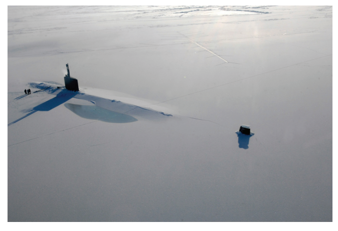
U.S. Submarine surfacing in the Arctic

also to the safety of the mariners, workers, and tourists who will populate this vast expanse. European Command is committed to a future that includes collaboration with our partners, NATO members, and Russia on international search and rescue exercises, Arctic training, and transparent operations and diplomacy that fully