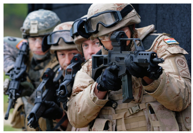
Croatian and Minnesota National Guard soldiers prepare to clear a room during an Operational Mentoring and Liaison Team training exercise at the Joint Multinational Readiness Center

Both on and off the continent, the Army in Europe planned for and exercised ground capabilities to support key NATO partners and Israel in defending against potential threats. It has worked with Israel to significantly improve their ballistic missile early warning capability and has enhanced bilateral air and missile