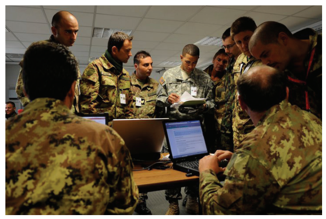
American and Italian technicians work to establish network connections during exercise Combined Endeavor 2010

This marked COMBINED ENDEAVOR's 16th year building partnerships and featured the participation of Iraq and Afghanistan as observer nations. Both nations committed to increased involvement and a dedication to interoperability between their national forces and NATO/Partnership for Peace nations.