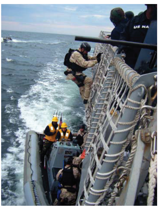
Members of the visit, board, search, and seizure team from the guided-missile destroyer USS Forrest Sherman (DDG 98) return to Forrest Sherman after participating in a boarding training exercise during BALTIC OPERATIONS

successfully fired three submarine-launched ballistic missiles over a period of two days. These operations reveal a renewed Russian focus on the undersea arena. Intelligence, Surveillance and Reconnaissance . Naval Forces Europe expanded European Command's intelligence, surveillance and reconnaissance in support of allies through Operation NOMAD SHADOW, Operation SPRING OFFENSIVE, and the first-ever ship-based Unmanned Aerial Vehicle missions in the Black Sea. It also expanded the capability of naval bases in Rota, Spain, and Sigonella, Italy, to support intelligence, surveillance, and reconnaissance assets in support of both the European