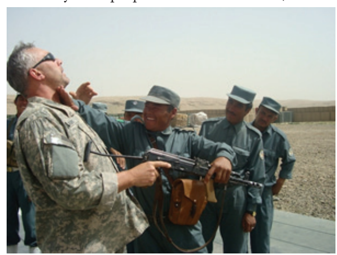
Combat training for Afghan National Security Forces

These requirements may include provision of equipment such as up-armored high mobility multipurpose wheeled vehicles (HMMWV) and mine-resistant ambush protected