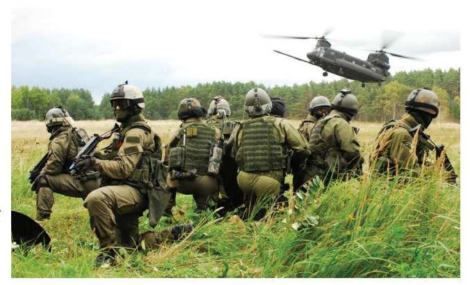
Coalition special forces wait for the MH-47G Chinook to land so they can extract their high value target during the opening ceremony for Jackal Stone 10

Croatia, Romania, and the United States. As a key element of the Partnership Development Program, JACKAL STONE provides special operations forces the opportunity to train together and build mutual respect while sharing doctrinal concepts, training concepts, and various tactics, techniques, and procedures.