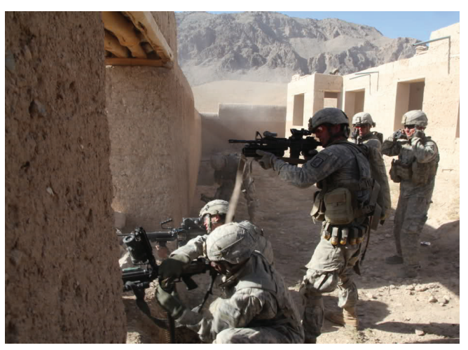
U.S. Army Soldiers from the 173rd Airborne Brigade Combat Team get ready to engage enemy combatants

14 countries. We have also trained over 1,860 soldiers from 15 countries to counter the threats posed by improvised explosive devices, and trained two Polish Brigades and two Georgian battalions for deployment to Afghanistan. On the logistics side, we have moved 487 tons of