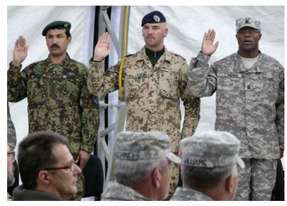
International Security Assistance Force non-commissioned officers (NCO) raise their right hands and repeat the charge of the NCO during an NCO induction ceremony in Afghanistan

In quantitative terms, since I last appeared before this committee, European Command has dispatched over 20 mobile planning teams and conducted three Observer Mentor Liaison Team rotations at the Joint Multinational Readiness Center, which included 16 countries and 1,045 personnel and conducted eight Expeditionary Intelligence Training courses in which we have trained 230 personnel from