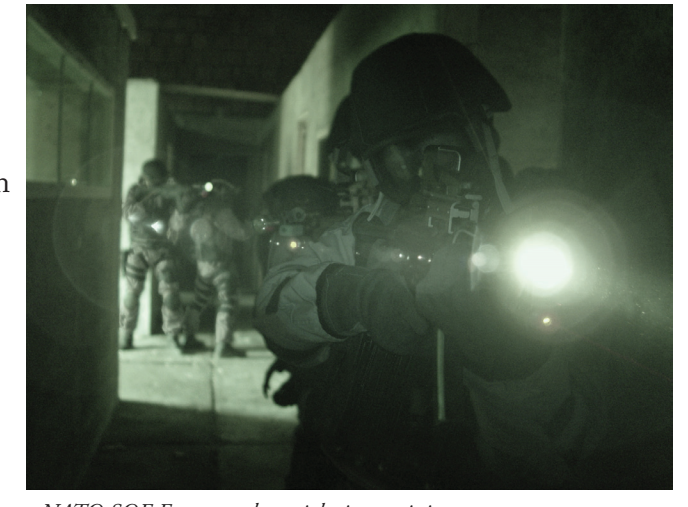
NATO SOF Forces conduct nighttime training

Afghanistan, demonstrates this operational