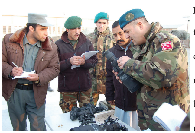
Afghan National Police and Afghan National Army personnel receive technical training on night vision goggles and thermal cameras by a Turkish officer

The situation in Afghanistan today is complicated and deeply challenging, as external