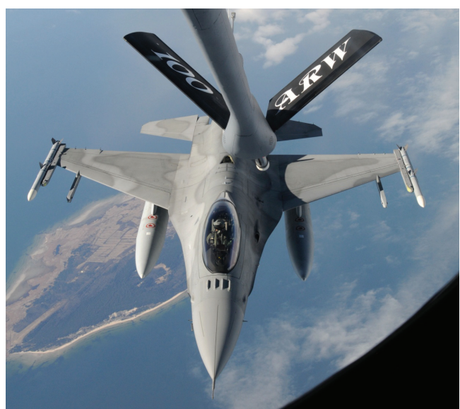
A Polish Air Force F-16 receives fuel from a US Air Force KC-135 over the skies of Latvia during a NATO Baltic Air Sovereignty Training event

Supporting contingency operations at the same rate as U.S.-based forces, Air Forces in Europe simultaneously conducted European Command operational requirements. In addition