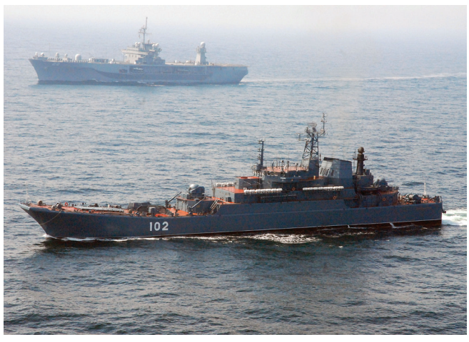
Russian amphibious ship, the RFS Kaliningrad, sailing alongside the USS Mount Whitney as parts of the BALTIC OPERATIONS exercises in the Baltic Sea

rebuild a structure for our bilateral defense