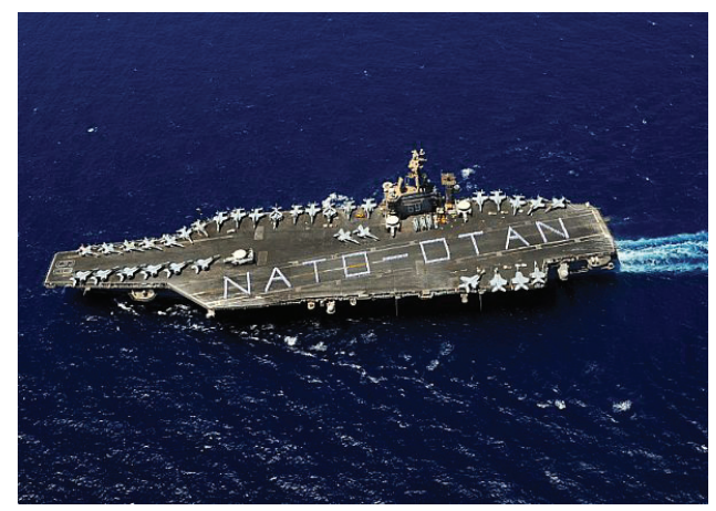
The USS Dwight D. Eisenhower Carrier Strike Group crew spells out NATO on the deck

take active steps to prevent them from becoming larger conflicts. The role accorded to Crisis Management in the Strategic Concept also reaffirms NATO's unique and essential role as a transatlantic forum for consultations on all matters that affect the territorial integrity, political independence, and security of its