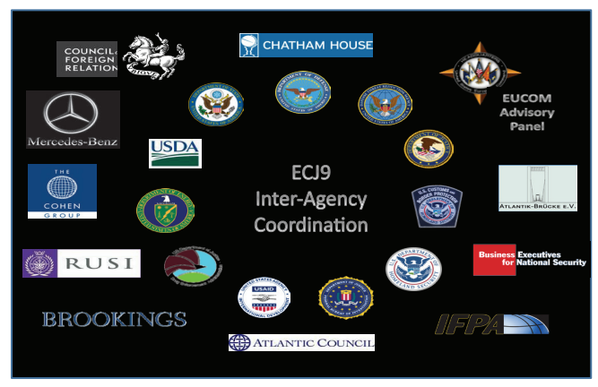
Interagency, academic, public, and private partners of the U.S. European Command

the private sector, think tanks, and military academic organizations. In the private sector, for example, we have gained many new insights by partnering with numerous organizations. As part of our efforts to engage leading