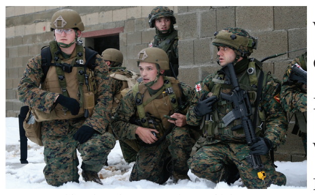
Georgian soldiers from the 31st Battalion establish security during a cordon and search scenario as they train for an upcoming deployment in support of International Security Assistance Forces in Afghanistan

will be able to operate independently. By using Georgian shadow instructors, Marine Forces Europe will create a Georgian training group that will largely take over the Partnership Training Program by their fourth rotation. Over this past year, this program trained two battalions that deployed to Afghanistan.