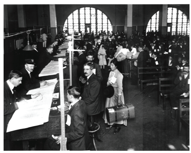
European immigrants entering the U.S. through Ellis Island

The most important ties for our command, of course, are those between our militaries. U.S. military traditions grew out of European ones. We have learned from each other, often in