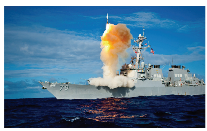
A Standard Missile - 3 (SM-3) is launched from the USS Hopper (DDG 70) in a Missile Defense Agency (MDA) test in conjunction with the U.S. Navy

As we work to provide defenses for our deployed forces, families, friends and allies, European Command continues the extensive and active cooperation necessary to implement the European Phased Adaptive Approach (EPAA) to Missile Defense. Together with our partners in the Department of State,