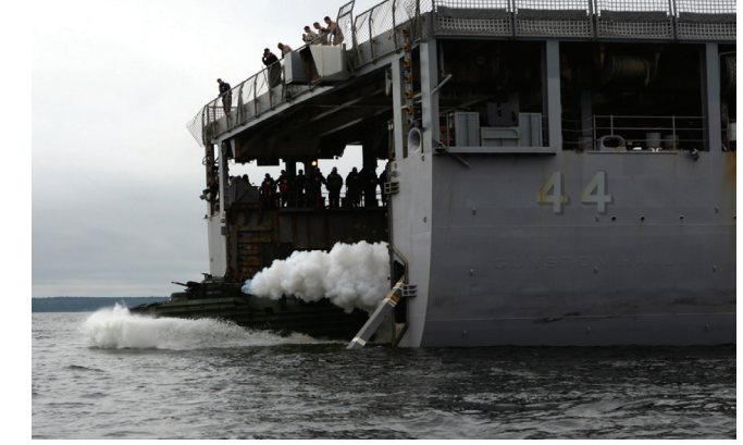
U.S. Marines amphibious assault vehicles embarked aboard the USS Gunston Hall (LSD 44) depart the well deck during the start of a simulated amphibious assault. The combined U.S., Estonian amphibious landing was part of a demonstration of the interoperability between the two forces.

our Baltic State allies, conducted both a Maritime-Prepositioning Force offload and onward movement of combat equipment in Ventspils, Latvia, and a combined amphibious landing in Estonia during this European Command-sponsored Partnership for Peace Exercise. The overwhelmingly positive response