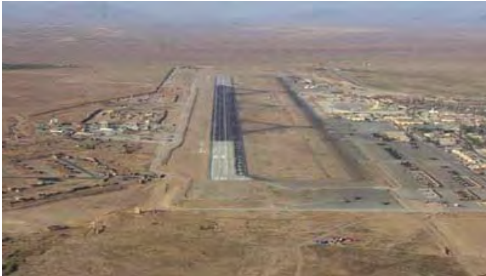
Figure 2: KAF (minimal terrain) (Tab Z-3)

The MP and MW spent the first five months of their deployment flying out of KAF. The area around KAF had very little elevated terrain (Tab V-1.4 to V-1.6). Four days before the MF, the MP’s squadron moved to BAF, which has high terrain (Tab AA-3). The MF was only the MP’s second sortie flown out of BAF (Tab V-1.9 and V-1.19). As the MP flew 40 night approaches into KAF, and only one prior night approach into BAF, it is possible he reverted to a mental model of flat terrain (Tab G-12 to G-15).