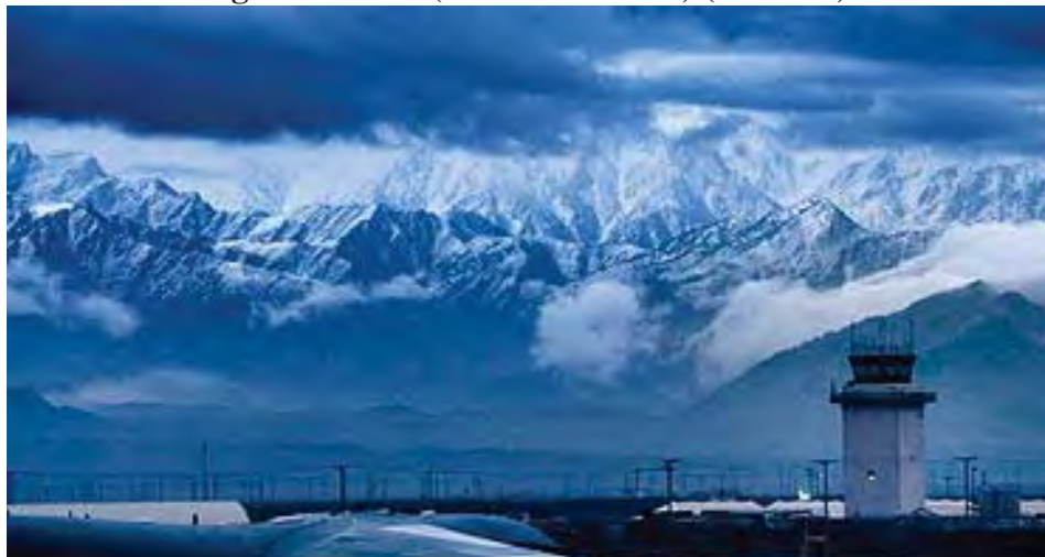
Figure 3: BAF (mountainous terrain) (Tab Z-5)