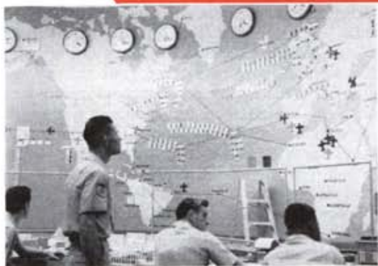
Command control board at Hq. MATS, Scott AFB, Ill., shows more than 150 aircraft in the air along the 5,600-mile route from Texas to Europe at the peak of Exercise Big Lift in October.