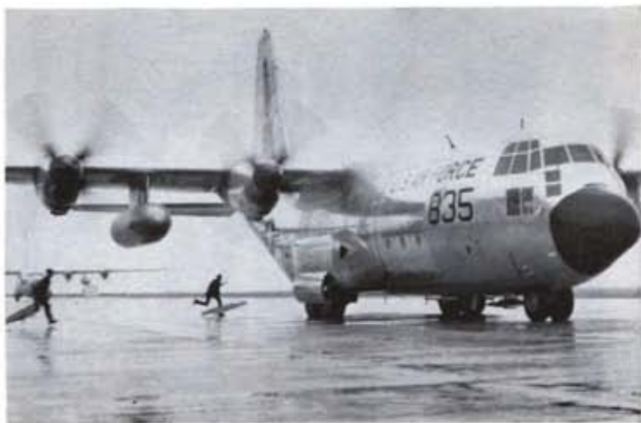
Alert crew hurries to put chocks under wheels of TAC Composite Air Strike Force Hercules transport arriving at Etain AB, France, USAF standby base used by F-100 fighters in exercise.