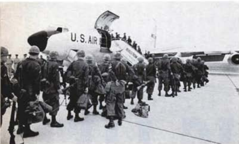
Men of 2d Armored Division of Ft. Hood, Tex., line up to board MATS C-135 transport at Bergstrom AFB, near Austin, for ten-hour nonstop flight to Rhein-Main AB, Germany to open Big Lift.