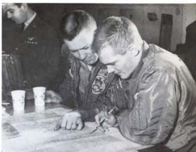
With air-ground maneuvers taking place as close as ten miles to the Communist border, USAF fighter and reconnaissance crews work out mission flight plans with special care.

Thus Big Lift, for all its shortcomings, was an impressive demonstration of how far the US has come in developing global mobility for ground forces, and how far we have yet to go in achieving truly mobile strike forces. For that alone, it should be worth the cost in money. But it is foolhardy to conclude that the narrow assumptions on which Big Lift was predicated provide valid reasons now to pull back ready forces facing Communists along the border. That would put added strain on the already strained NATO alliance, and, in the long run, cost much more.—END