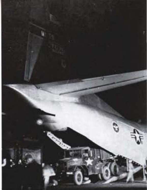
Once begun, airlift went on night and day, hauling 16,000 troops and 3.4 million pounds of equipment from Texas to Europe. Here C-130 takes on a truck.

F-100s went into Phalsbourg and Etain, F-105s into Chaumont, RB-66s into Toul-Rosieres, all in France, and RF-101s into Ramstein, Germany. Ramstein is headquarters for both USAFE's Seventeenth Air Force and NATO's Fourth Allied Tactical Air Force. Toul-Rosieres is the home of a Third Air Force RB-66 wing. The other three bases in France are maintained on