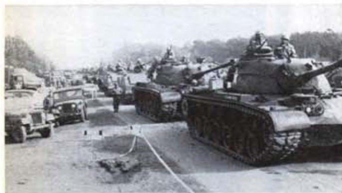
Tanks prepositioned in Europe and readied by US Army caretaker force along unused autobahn strip are picked up by troops of 2d Armored Division for use in Big Lift exercise.

problems in maintaining NATO unity. Thus a week later, after Big Lift had delivered its forces to Europe without a flaw, Secretary of State Dean Rusk visited Frankfurt—just a few miles from Rhein-Main Air Base where most of the Big Lift forces landed—and declared: "We have six divisions in Germany. We intend to maintain these divisions here as long as there is need for them—and under present circumstances there is no doubt that they will continue to be needed. . . . Does the airlift of an armored division mean the withdrawal of US troops from Germany? The answer is 'No.' . . ."