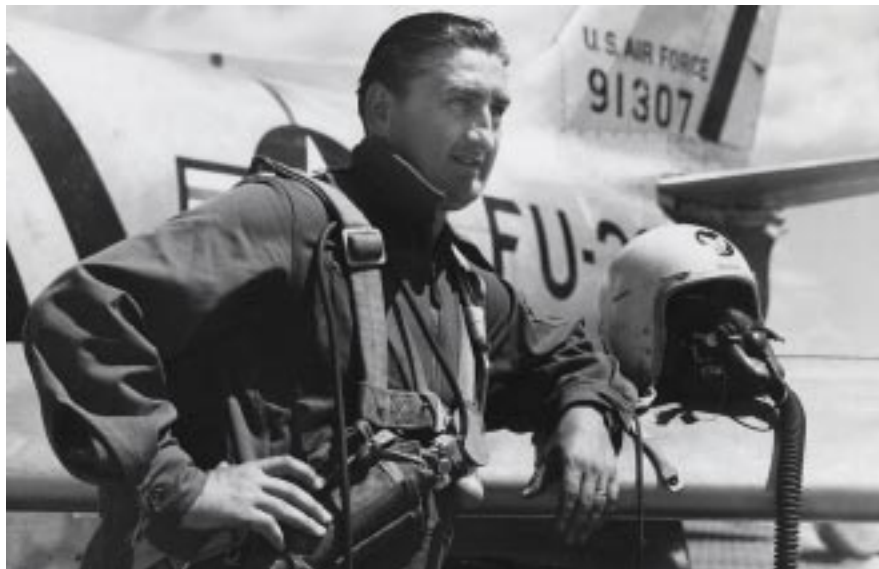
Col. Francis “Gabby” Gabreski had victories in two wars—28 kills in World War II and another 6.5 in the Korean War. His total of 34.5 victories is third-highest in Air Force history.

the F-15 and F-16 were designed to guarantee American airmen the advantage.