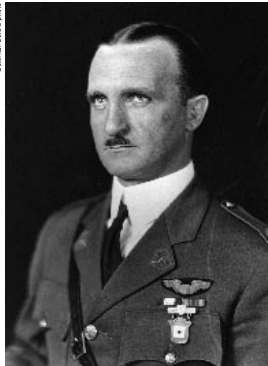
Brig. Gen. Oscar Westover was placed in command of the AACMO. He would die in an airplane crash in 1938.