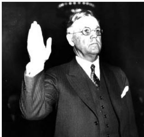
Walter Brown was appointed postmaster general in 1929 by the Hoover Administration.