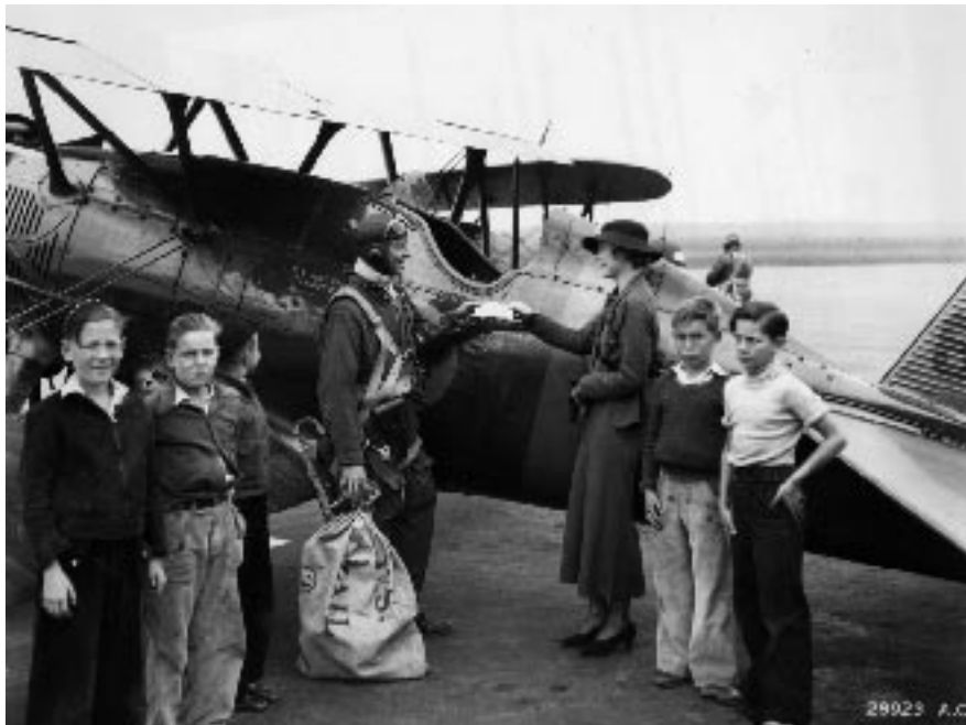
An air mail pilot takes an envelope before taking off on a mail run from March Field, Calif.