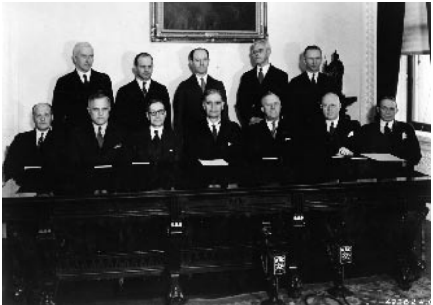
Members of the Baker Board in 1934 included Maj. Gen. Benjamin Foulois (seated, far left); George Dern, Secretary of War (seated, fourth from left); and Jimmy Doolittle (standing, second from left).