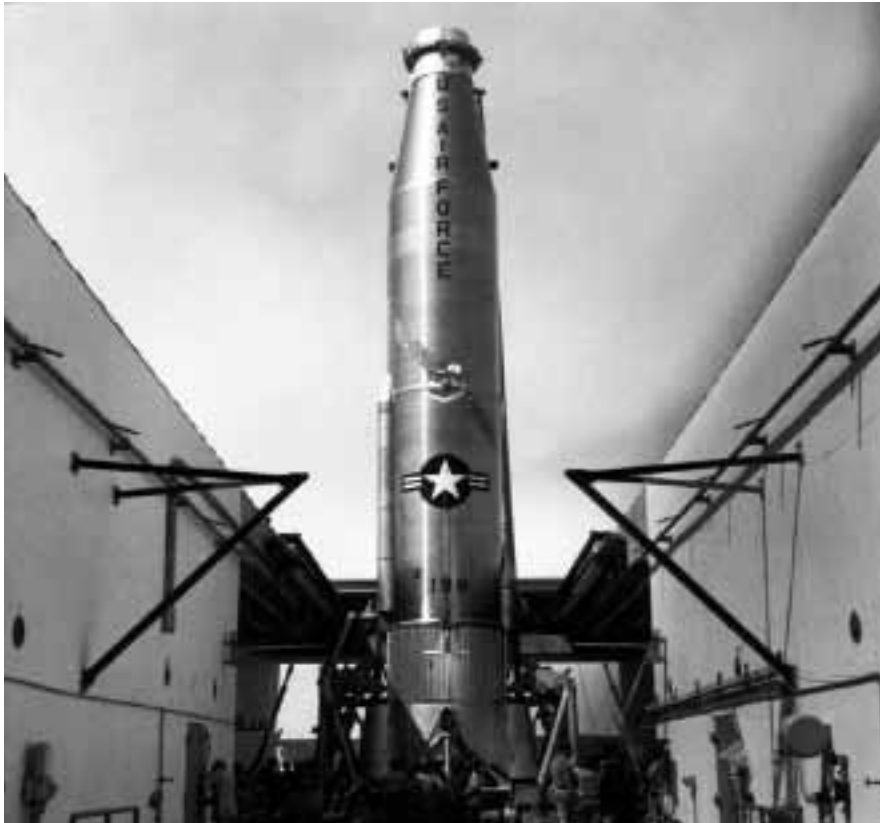
This Atlas D missile is shown at Vandenberg Air Force Base Complex B. It was later launched from Cape Canaveral in 1960.

Corp. and Martin Co. Defense cutbacks, coupled with Air Force skepticism at the time about the actual future of missiles, led to termination of the MX-774 contract three months before the scheduled first flight.