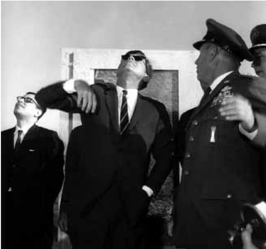
President Kennedy and observers watch a successful launch of an Atlas D on March 23, 1962 at Vandenberg.

The first Atlas A flight—a failure—took place June 11, 1957. It fell short of both target range (690 miles) and peak altitude (66 miles).