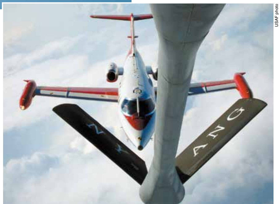
A Calspan Learjet, configured to fly like an RPA, maneuvers into refueling position under a KC-135R in these photos of automated aerial refueling demonstration test flights. By 2007, the system was considered fully successful.

The process relied on a combination of technologies. Inertial navigation assisted by GPS guided the receiver aircraft toward the refueling airplane. Once in close, the mating of the re-