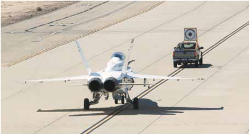
The F/A-18 research aircraft follows a pickup carrying an airborne tanker drogue image down a runway in early AARD testing. An RPA's approach to the boom is broadly based on optical recognition, aided by algorithms to improve prediction accuracy.