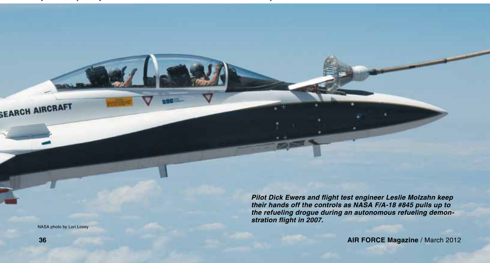
Pilot Dick Ewers and flight test engineer Leslie Molzahn keep their hands off the controls as NASA F/A-18 #845 pulls up to the refueling drogue during an autonomous refueling demonstration flight in 2007.