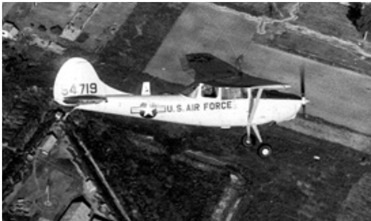
An O-1 Bird Dog searches the Vietnamese countryside.