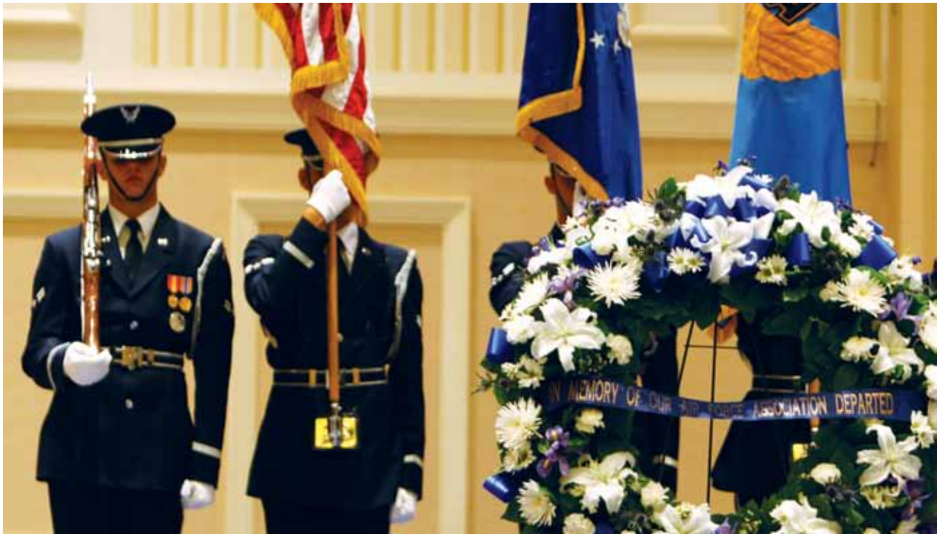
A USAF color guard stands at attention during the memorial wreath-laying ceremony, which honors those who have died during the year.