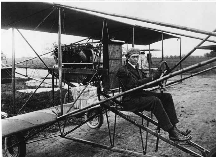
Glenn Martin, circa 1911, prepares to take off in a pusher biplane on a newspaper delivery flight from Fresno, Calif., to Madera, Calif., made as a promotional ploy to raise money for his aircraft production plant.

When America entered World War I in 1917, the US Army had no bombers. It had to make do with British Handley Pages and Italian Capronis. In January 1918, however, the Army contracted with the Glenn L. Martin Co. for the first true US bombers. These biplanes (an early version is shown above, over Washington, D.C., in 1919) were called the Glenn Martin Bombers and later renamed MB-1. Designed by the legendary Donald Douglas (founder of Douglas Aircraft), the GMB first flew on Aug. 15, 1918. It could carry a 1,040-pound bomb load for 390 miles at 105 mph. War's end in November 1918 truncated production at 10 aircraft, but the foundation had been laid.