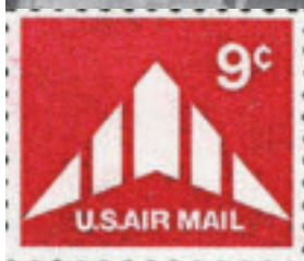
Stamp, issued in 1971, with a B-2-like image.