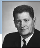
Joe Foss President, 1961-62 Chairman, 1962-63