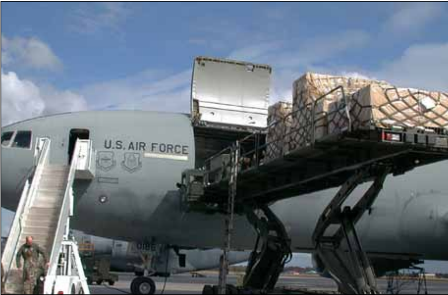
Not all AEF deployments will be targeted toward combat operations. Here, relief supplies are loaded on a KC-10 bound for Guatemala in the aftermath of flooding last year. Suffering itself may be the "target" that AEFs will attack.