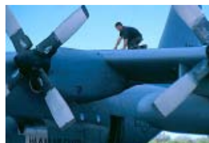
At left stands one of the C-130 transports flown by the wing's 204th Airlift Squadron.

Although it is the wing's smallest flying unit, the 204th's four C-130 cargo aircraft and their crews are in heavy demand. Besides flying regular support missions throughout the Pacific, the airlift squadron provides tactical airdrop and paratroop drops for the US Army's 25th Infantry Division, stationed on Oahu at Schofield Barracks. The unit also participated in operations in Bosnia and Kosovo.