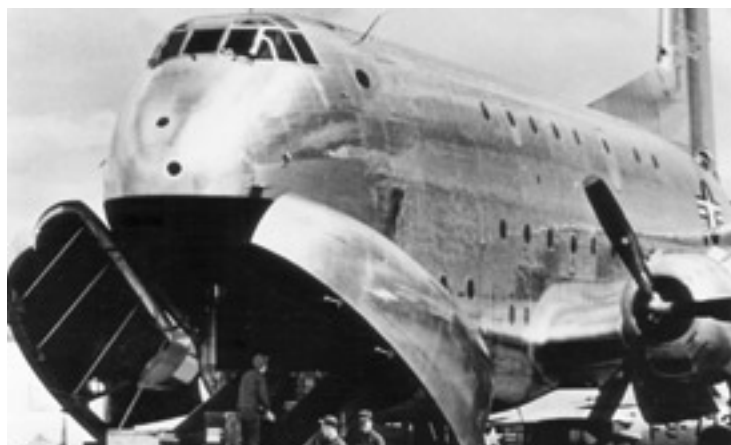
The clamshell doors made loading a snap.