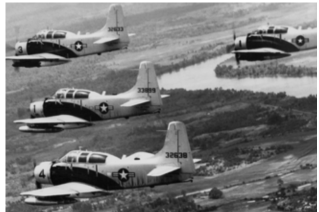
In Vietnam, A1Es head to the fight.

Designed in single night at Statler Hotel, Washington, D.C. ★ nicknames included Able Dog, Sandy, Spad, Hobo, Firefly, Big Gun, Zorro, Old Miscellaneous, Fat Face, Flying Dump Truck ★ 191 USAF models lost in Vietnam ★ featured in 1997 documentary "Little Dieter Needs to Fly" ★ missions included attack, close support, reconnaissance, electronic warfare, early warning, and search and rescue ★ ejection used extraction rockets connected to parachute harness.