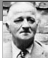
Carl A. Spaatz Chairman, 1950-51