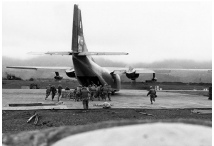
A Provider on the ramp in Southeast Asia.

Nicknamed "Bookie Bird" ★ operated from land, water, ice, snow, sand ★ flown by Air America, CIA proprietary airline ★ used for night bombing of Ho Chi Minh Trail ★ sometimes capsized when taxiing in strong crosswinds ★ used as personal transport by Gen. William Westmoreland, MACV commander ★ featured in films "Air America" (1990), "Operation Dumbo Drop" (1995), and "Con Air" (1997) ★ displayed motto, "Only we can prevent forests" (defoliation aircraft).