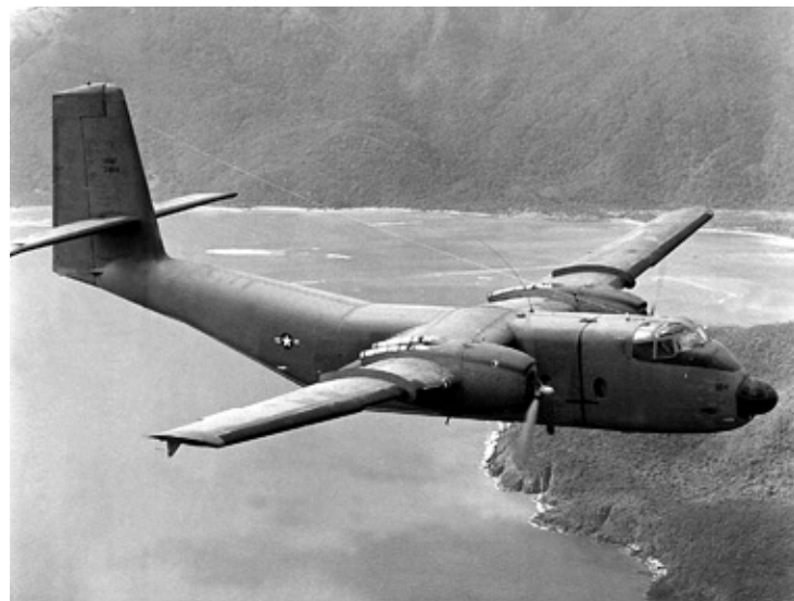
A USAF C-7 Caribou on a mission over Vietnam in January 1967.