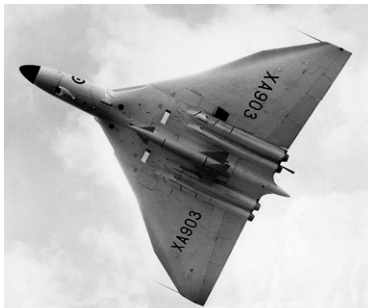
For its time, the delta wing was cutting edge.

Appeared in 1965 James Bond thriller "Thunderball" ★ nicknamed "Tin Triangle" ★ carried nuclear bombs named Yellow Sun, Violet Club, Blue Danube, Red Beard ★ performed near-vertical bank, upward barrel roll at 1955 Farnborough air show ★ flew Britain-Australia route in record 20 hours, three minutes (1961) ★ modified for maritime radar reconnaissance and air tanking ★ began as a radically new tailless design ★ had only two ejection seats (for pilots) ★ crashed into Detroit suburb in 1958.