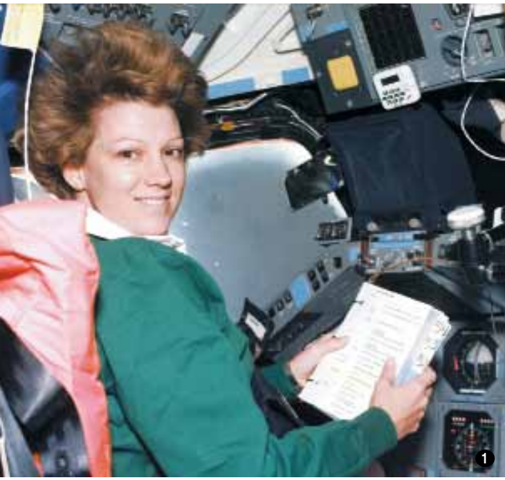
111 USAF Col. Eileen Collins led shuttle mission STS-93 in 1999, and, following the Columbia accident, commanded the STS-114 “return to flight” mission in 2005. She is the only woman to have both piloted and commanded shuttles. 121 Endeavour, docked to the ISS Destiny laboratory in 2002, early in construction of the space station. Both the shuttle’s own manipulator arm and that of the ISS—called the “Canadarm,” because it was built by Canada, are in use in this image. 131 Kevin Chilton, Challenger commander, greets cosmonaut Yuri Onufrienko after docking with the Russian Mir space station in 1996. Chilton became a four-star USAF general and head of US Strategic Command. 141 The last shuttle crew, of mission STS-135, before boarding Atlantis in July 2011. Though shuttles routinely carried up to seven people, the last mission was limited to four in case of a problem preventing the shuttle from landing. The crew would have had to return on cramped Russian Soyuz craft, limited to three people each.