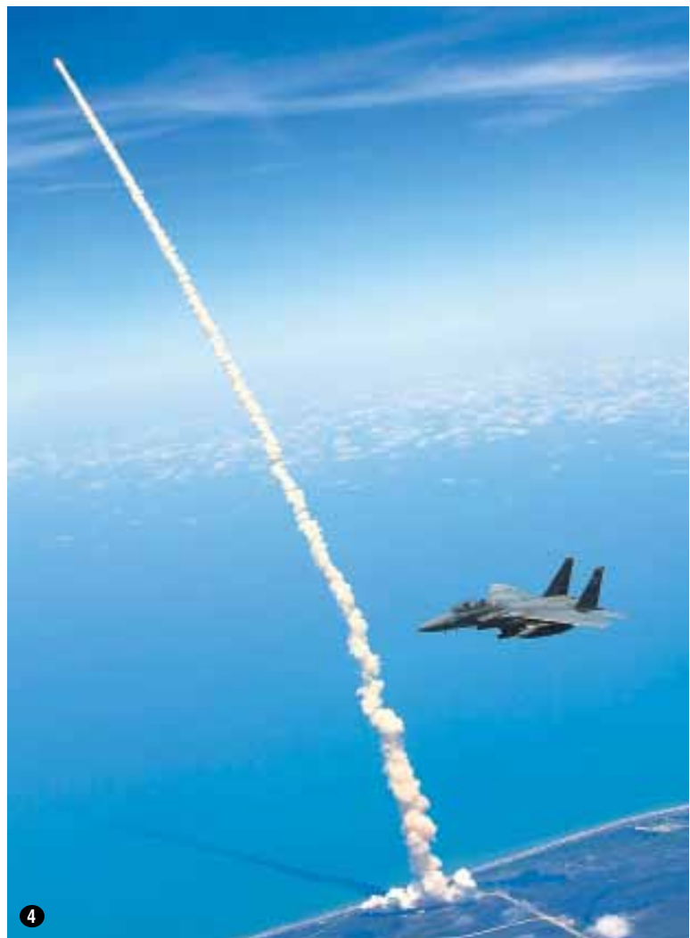
1 Susan Helms, first US military woman in space, made five shuttle flights. Now a three-star general and head of 14th Air Force, she holds the record for longest space walk, at nearly nine hours. She is shown aboard the ISS in 2001. 2 A Florida Air National Guard F-15C overflies Endeavour just prior to a mission. Such combat air patrols have been flown in support of shuttle missions since 9/11. 3 Atlantis moves in to dock with ISS over the Bahamas. 4 An F-15E from Seymour Johnson AFB, N.C., helps assure an uneventful liftoff for Atlantis in 2010.