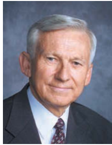
VICE CHAIRMAN, AEROSPACE EDUCATION