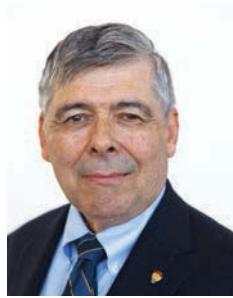
VICE CHAIRMAN, FIELD OPERATIONS