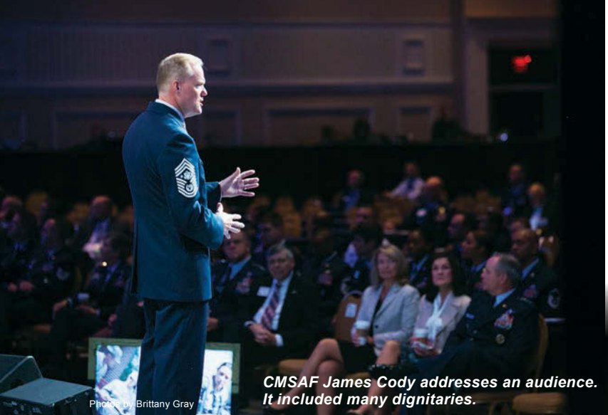
CMSAF James Cody addresses an audience. It included many dignitaries.