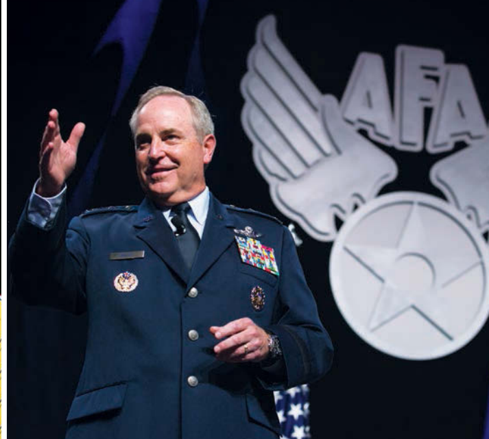
Air Force Secretary Deborah Lee James (l) and USAF Chief of Staff Gen. Mark Welsh (r) were key speakers at AFA's Air & Space Conference.