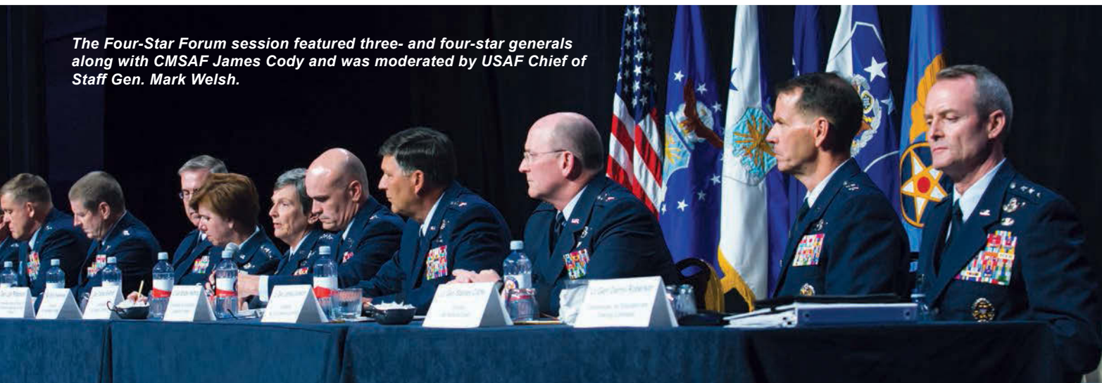
The Four-Star Forum session featured three- and four-star generals along with CMSAF James Cody and was moderated by USAF Chief of Staff Gen. Mark Welsh.

Senior Air Force, DOD, and government leadership speaking at the conference included Carter, James, Welsh, and Cody. Other high-level leaders included Assistant Secretary of the Air Force for Acquisition William A. LaPlante;