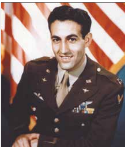
Don Gentile (19.83)

Ranks are as of last victory in World War II.