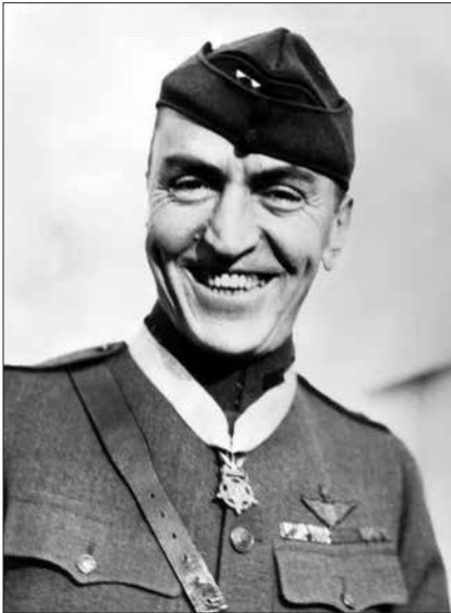
Eddie Rickenbacker (26)