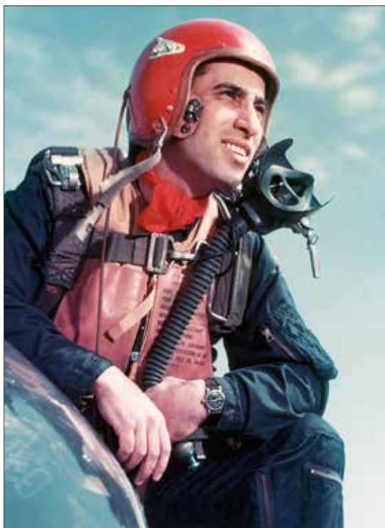
James Jabara, the first USAF ace of the Korean War. Jabara scored 15 victories before the end of the war.