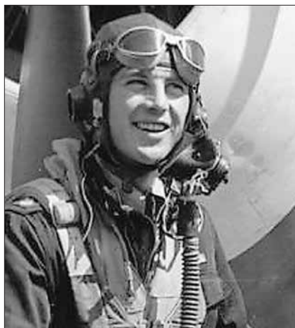
Hubert Zemke (17.75)

*Squadron Leader Gladych was Polish and flew in service with American units, but because the Polish government in exile was headquartered in London, Polish pilots had British designations.