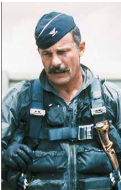
Robin Olds is the only USAF ace with aerial victories in both World War II and the Vietnam War.