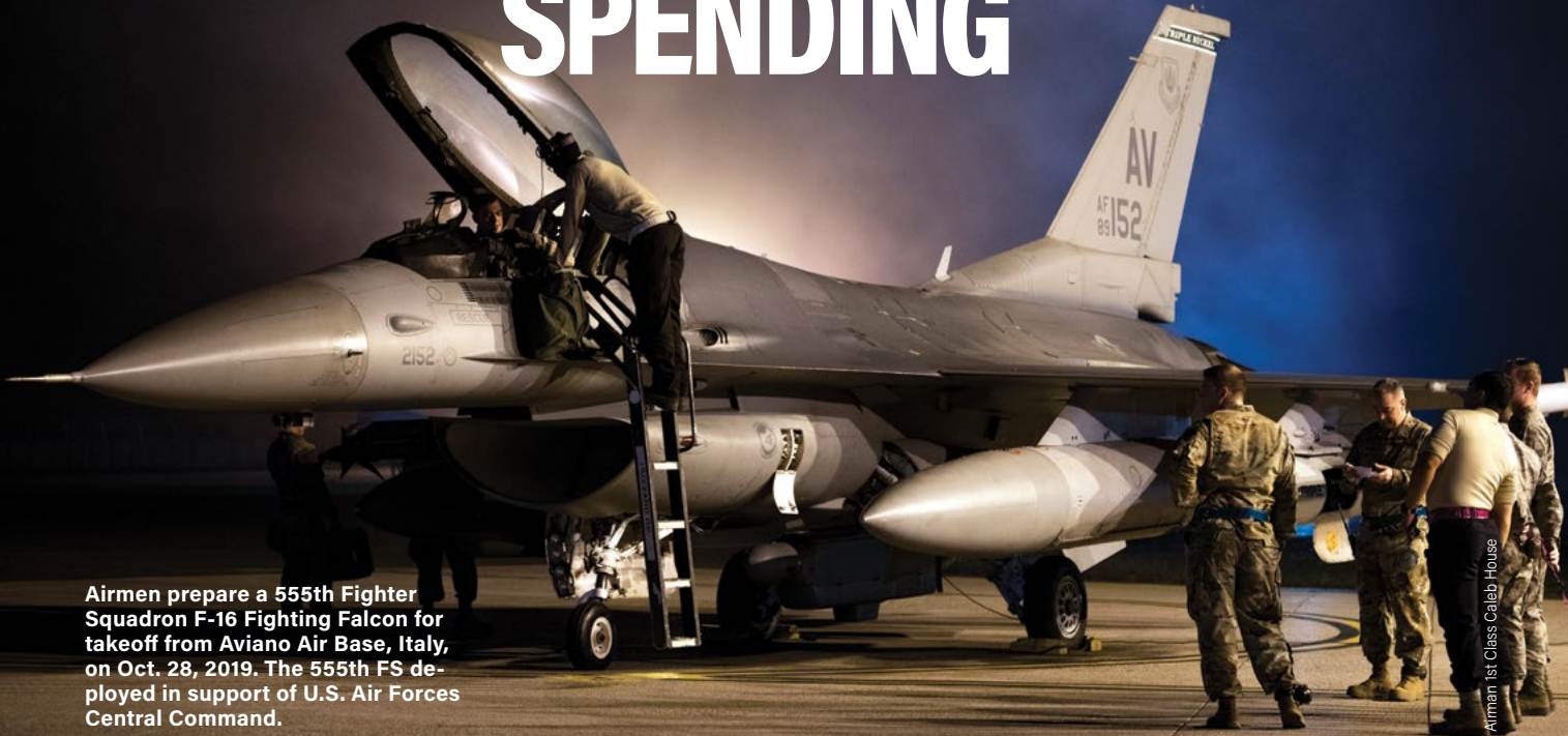
Airmen prepare a 555th Fighter Squadron F-16 Fighting Falcon for takeoff from Aviano Air Base, Italy, on Oct. 28, 2019. The 555th FS deployed in support of U.S. Air Forces Central Command.